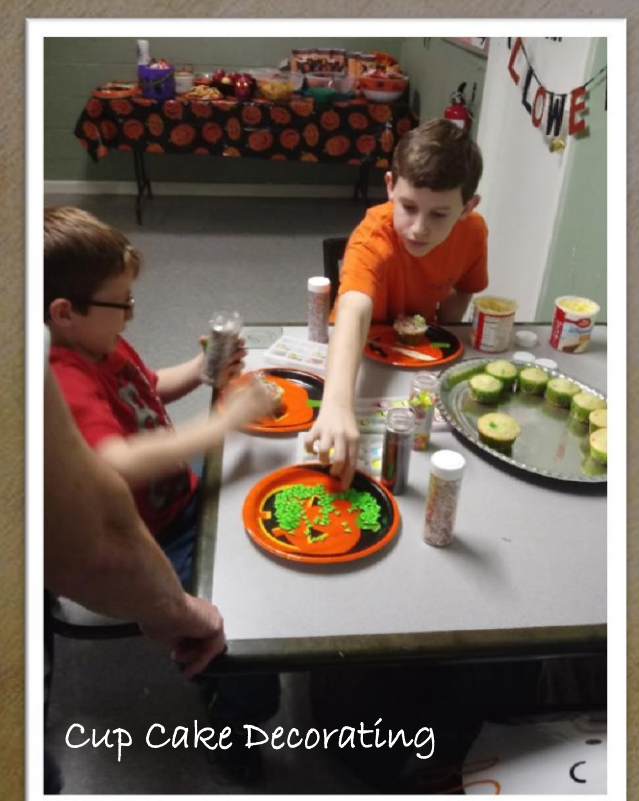
Everyone had a Great Time . . . Thank you to all who participated.