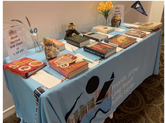
Our Silent Auction raises funds for new books