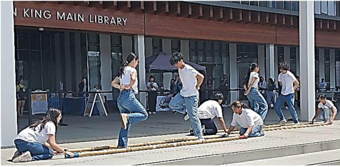
Bamboo dancers from Millikan High School

Inside the library, poetry readings took place in the Miller Room; meeting rooms hosted adult author presentations; and the Story Theater hosted children's reading groups.