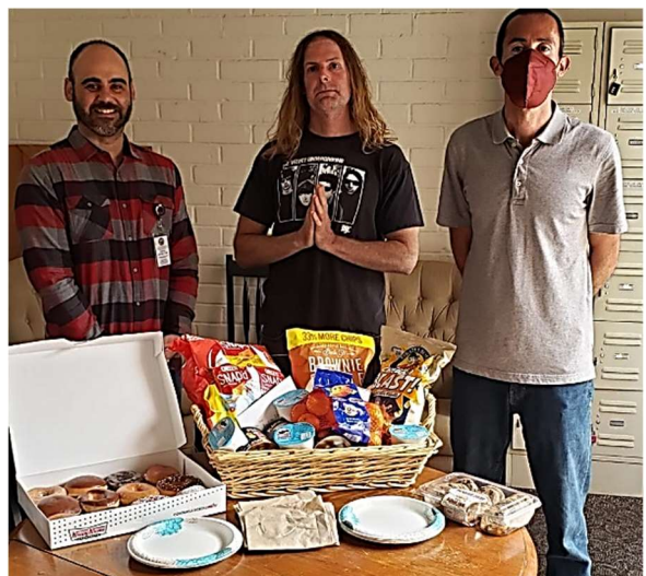
Los Altos staff are always fun to visit!