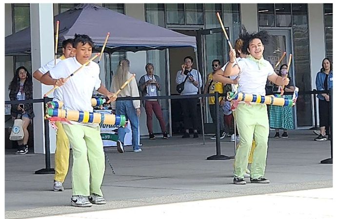
Millikan High School musicians at the AAPI Festival