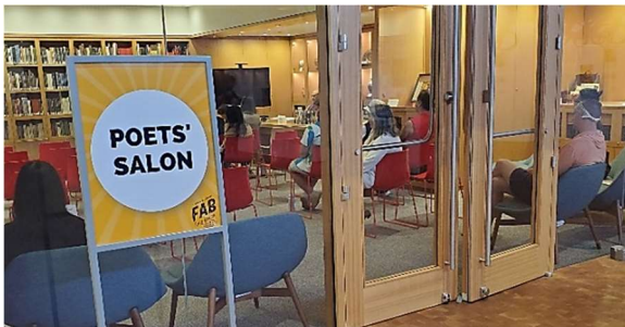
Miller Room Celebrates AAPI Poets at BKJ Main

Along with other Long Beach organizations, the Friends of the Library sponsored the event for the second year.