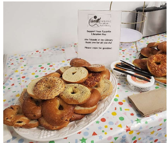
Treats for BJK Main staff

The Friends of LBPL celebrated National Library Workers' Day on April 25 by delivering fruit, cookies, scones, muffins, and other treats to our wonderful library staffs at each of the branches and BJK Main. We appreciate everything they do for our community every day of the year. Long Beach is very fortunate to have our exceptional library system, and each one of these professionals make this happen. Thank you.