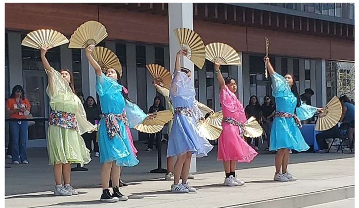
Whitney High School dancers at the AAPI Celebration on the BJK Terrace

The outdoor Terrace was the stage for dance performances from Millikan High School and Whitney High School students while the enthusiastic audience watched from the grounds of Lincoln Park. On the terrace, library patrons browsed books available from Long Beach's Bel Canto Books, Kubo LB, Native Sol, Bitty Bao, and Books and Bao. Young adult and teen authors were featured at writing workshops and panel discussions.