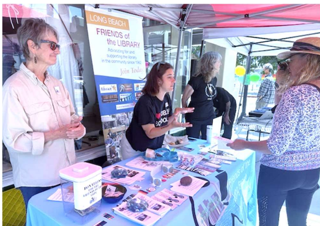
In August, we joined the Retro Row community event on 4 th Street to get a head start on Banned Book Week

Thank you to all the volunteers who helped bring these events to our community.