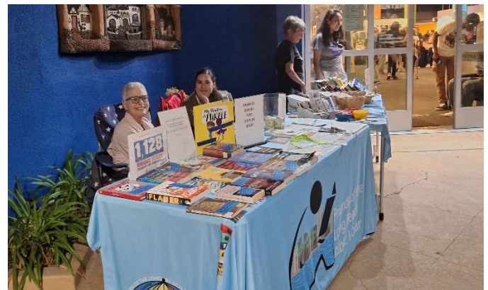
Our team at the Expo Center