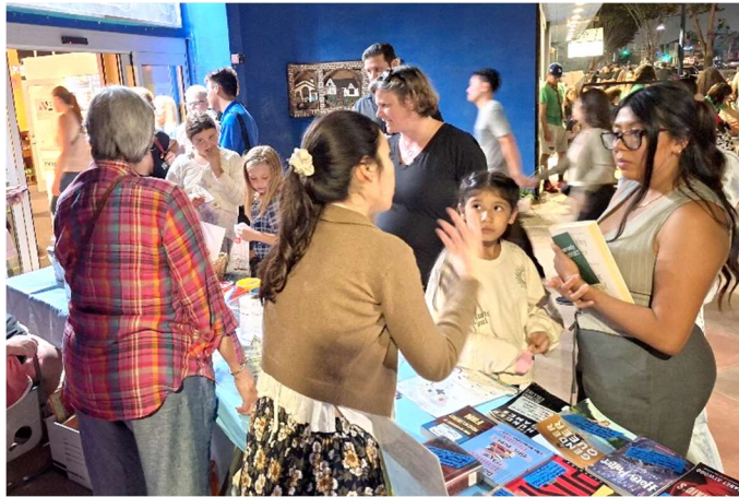
First Fridays in Bixby Knolls

educating the public about our freedom to read, we sold books and media at reduced prices. The staff at Main helped greatly with logistics and provide music throughout the day. Truly, it was a fun and lively event.