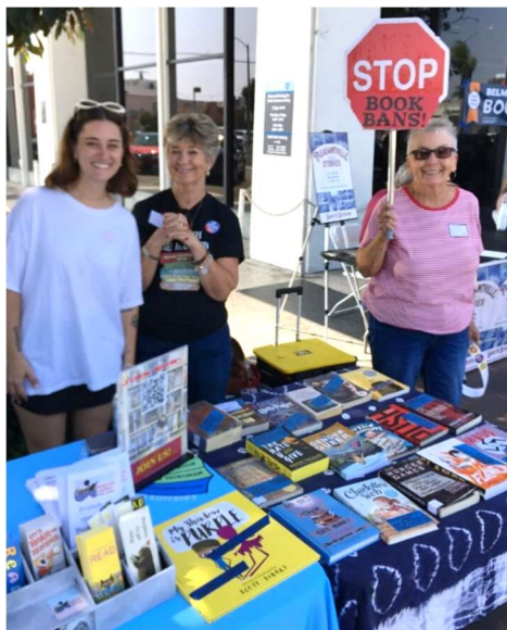
Ready to help people understand book censorship.

Following dates chosen by The American Library Association (ALA), we planned our activities around Banned Book Week. We really lucked out in joining the Belmont Shore Business Association's first ever Book Fest on Sunday, Sept. 22 (which fortuitously was the first day of the ALA's annual Banned Book Week).