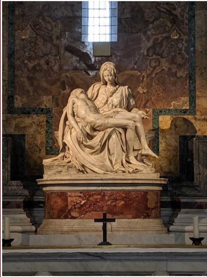
Michelangelo – La Pietà