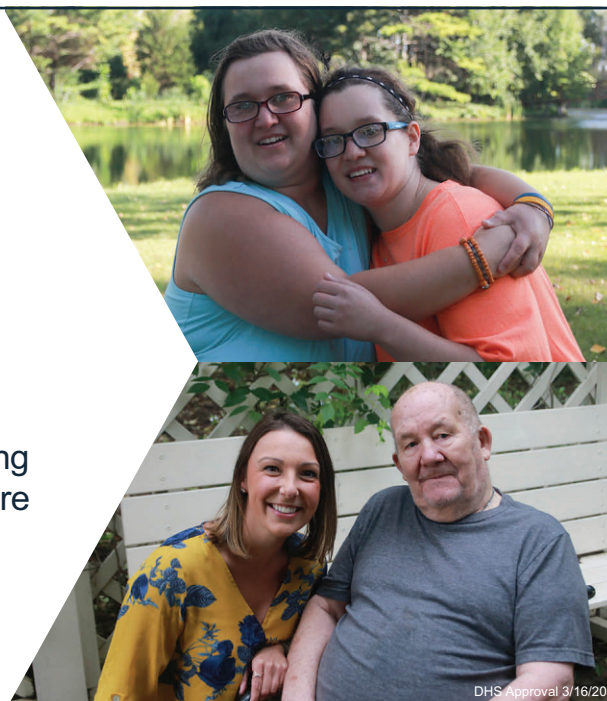
DHS Approval 3/16/20