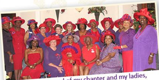
I am very proud of my chapter and my ladies, The Red Hat Roadrunners!