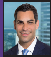
Francis Suarez Mayor City of Miami