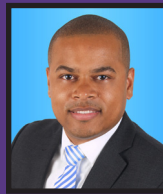
Keon Hardemon Commissioner City of Miami