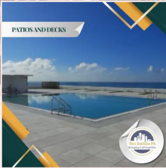
PATIOS AND DECKS