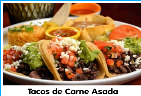
Tacos de Carne Asada