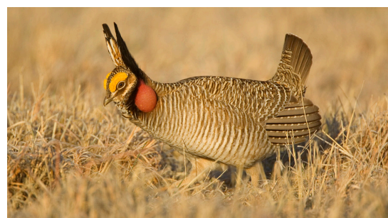
Lesser Prairie-Chicken by Eleanor Briceati