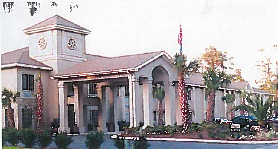
HOLIDAY INN EXPRESS, Saint Simons Island, Georgia

The holiday Inn Express is a two story, 26,000 Square Foot hotel located on Saint Simons Island, Georgia. This hotel was built in conformance with the local "Island Architecture."