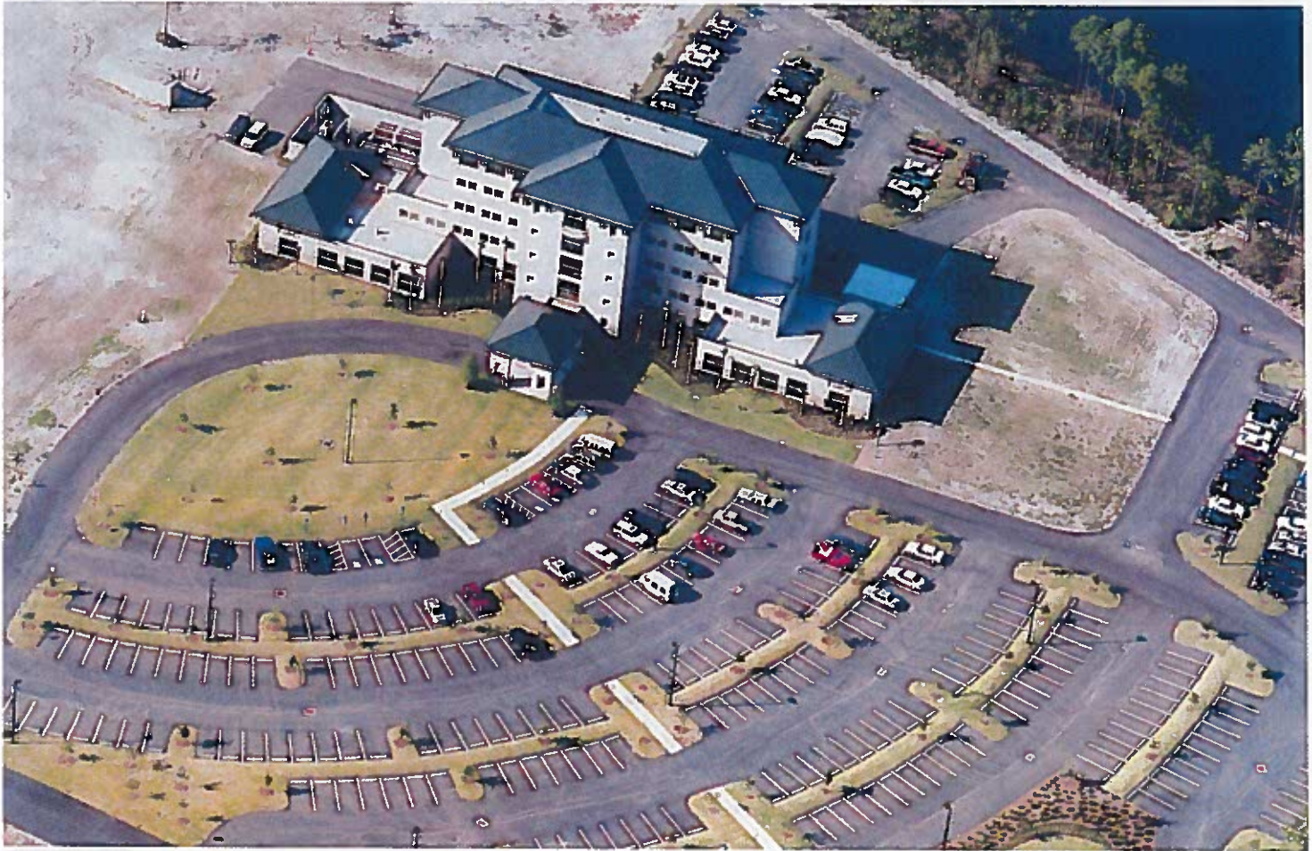
SUMMIT PROFESSIONAL PLAZA Dunwoody, Georgia