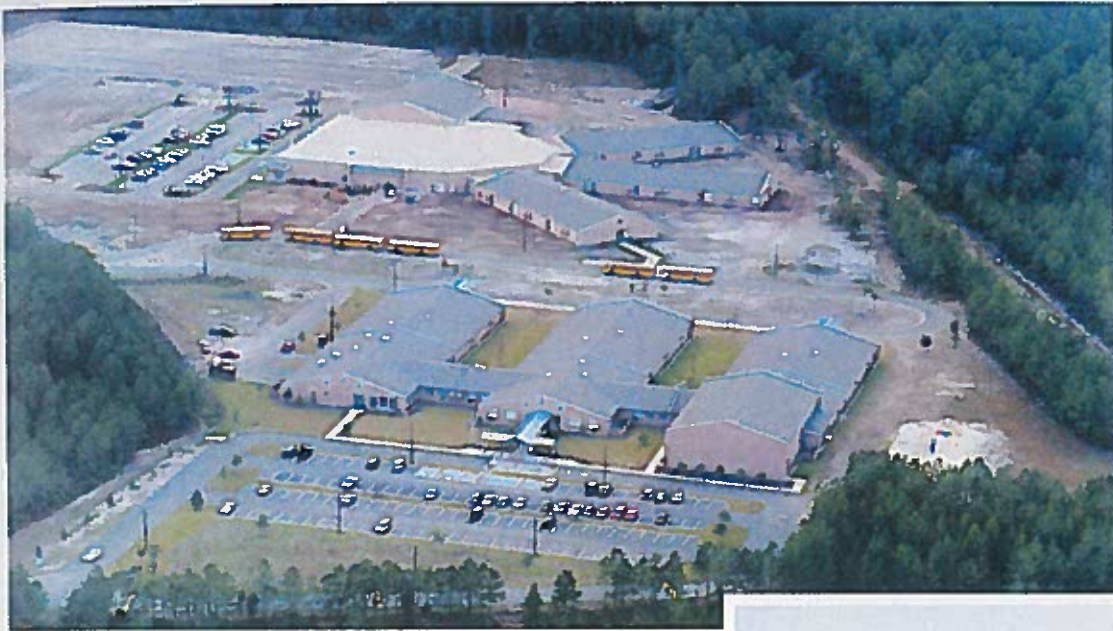
GREER ELEMENTARY SCHOOL Glynn County, Georgia

Mitchell Construction Company was the Construction Manager/General Contractor for four Schools in Glynn County, Georgia. Greer Elementary School is shown. MCC is proud to have developed a strong relationship with the local School Board. This strong relationship has been based on excellent construction value, quality workmanship, on time delivery, and guaranteed cost control.