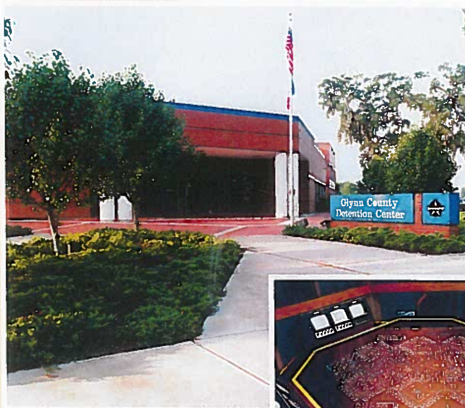
Central Control Console Glynn County Detention Center

Built in Brunswick, Georgia. This 95,000 Square Foot facility has a state of the art computerized detention system and contains 188 individual detention cells and Sheriff's Office.