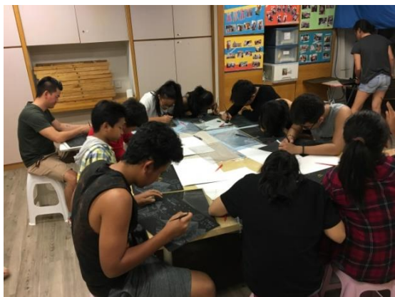
(Left) engaged in creative work at the ICM centre.