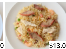
Special Fried Rice