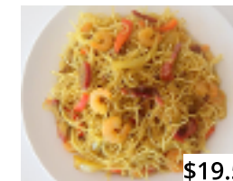
Singapore Noodles (curry sauce)