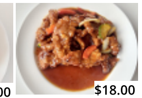
Pork Ribs & Special Sauce