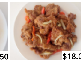
Salt & Spice Pork