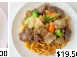
Combination Chow Mein