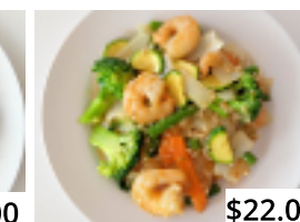
Garlic King Prawns