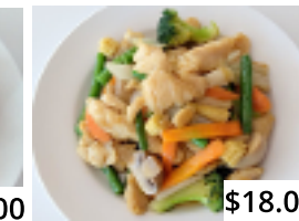
Chicken & Vegetables