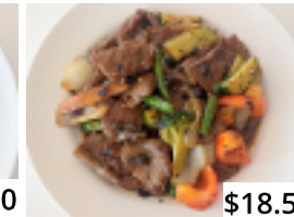
Beef & Black Beans