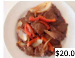
Fillet Steak Chinese Style