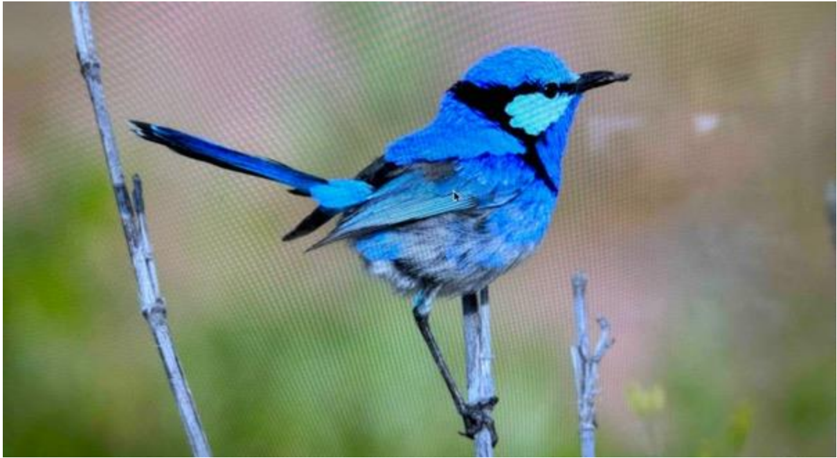
Splendid Fairywren at Bowra Sanctuary (screen shot of Google Maps photo)