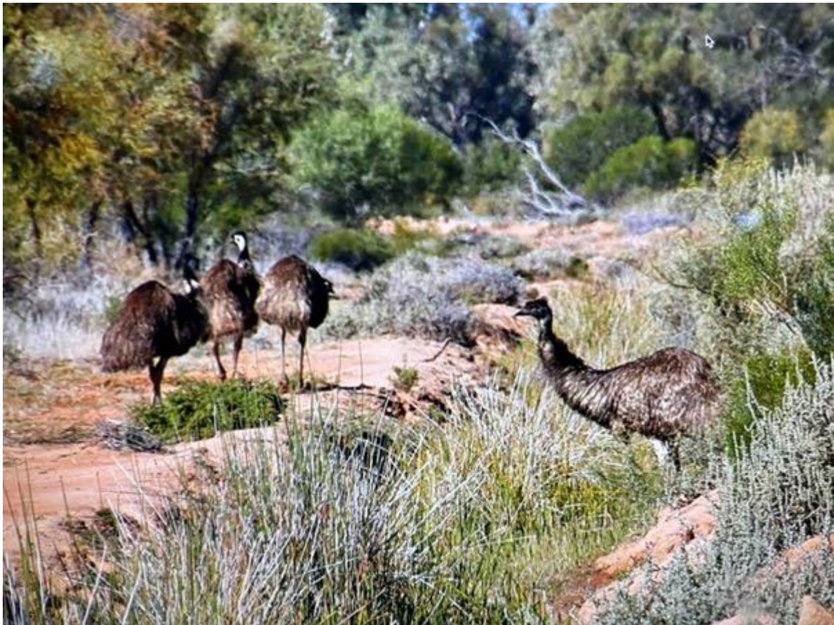
Emus at Bowra Sanctuary (screen shot of Google Maps photo)

If you are interested in joining the PIG shoot at Bowra Sanctuary that will provide a fantastic opportunity to photograph the abundant birdlife like emus and the splendid fairywren (see page 6), contact Jim Watters. Note there is limited accommodation in Cunnamulla so book early.