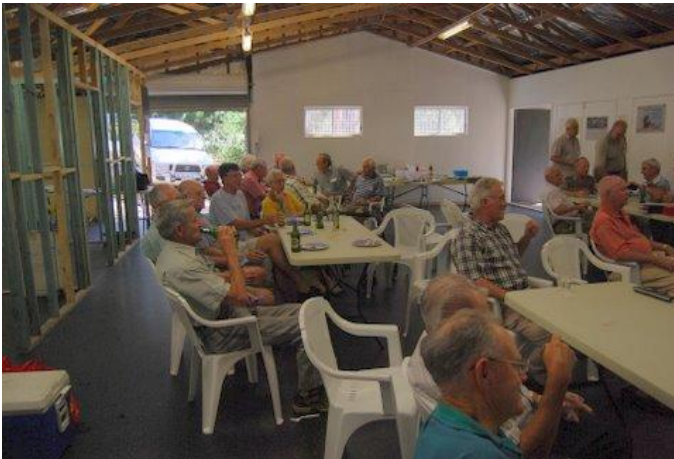
Members attending the first Shed West Annual General Meeting.

Following the recent incorporation of Shed West as a not-for-profit organisation the first Annual General Meeting was held on Melbourne Cup day immediately preceding the Cup festivities.