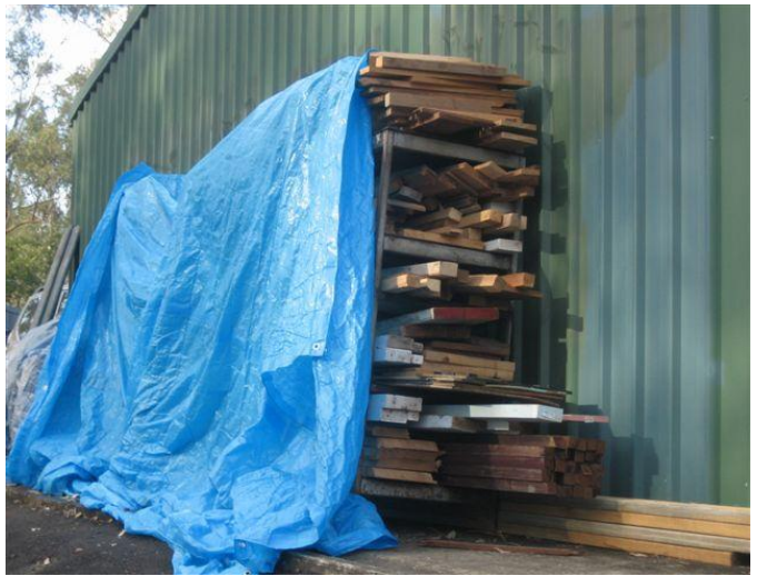
Timber resources already available at the Shed.

As Shed West progresses to our soft opening, and resulting from the decisions of the last General Meeting and the start of the new financial year, it is time to pay Shed West Membership fees of $50 annually based on a financial year. Pro rata fees will apply from January to 30 th June 2010. These fees can now be paid at Shed meetings or by post to PO Box 391 Kenmore Q 4069. The $2 per meeting fee remains and there will be fees for machinery use and materials once the Shed is operating. The fees are important to keep the basic shed services like electricity, water and insurance operating.