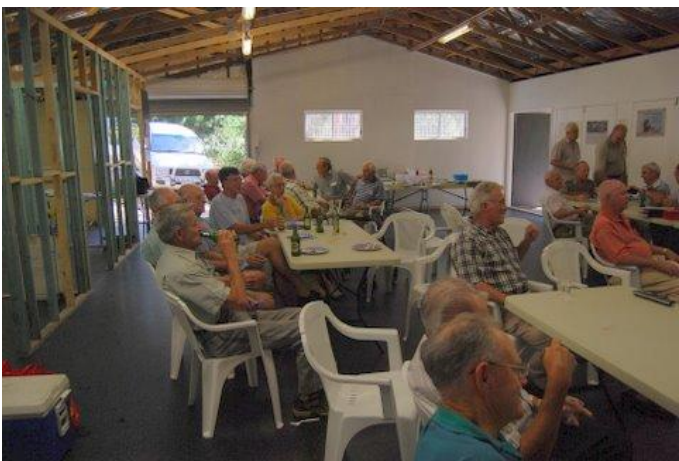
Members attending the first Shed West Annual General Meeting.

Following the recent incorporation of Shed West as a not-for-profit organisation the first Annual General Meeting was held on Melbourne Cup day immediately preceding the Cup festivities.