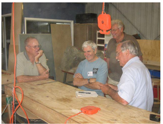
Planning activities in progress around one of the member built benches in the Shed.