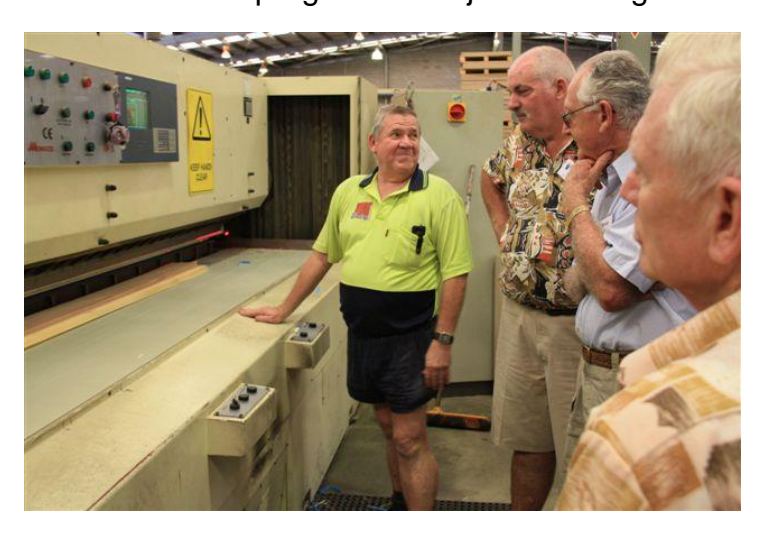
Above members visited a veneer factory to learn about the different materials and how they are made.

Please note the program is subject to changes.