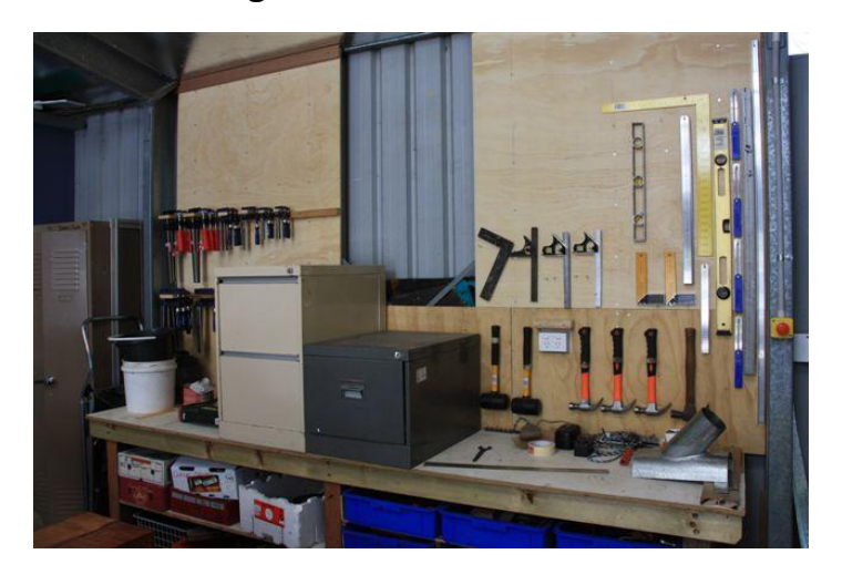
Part of the woodworking area.