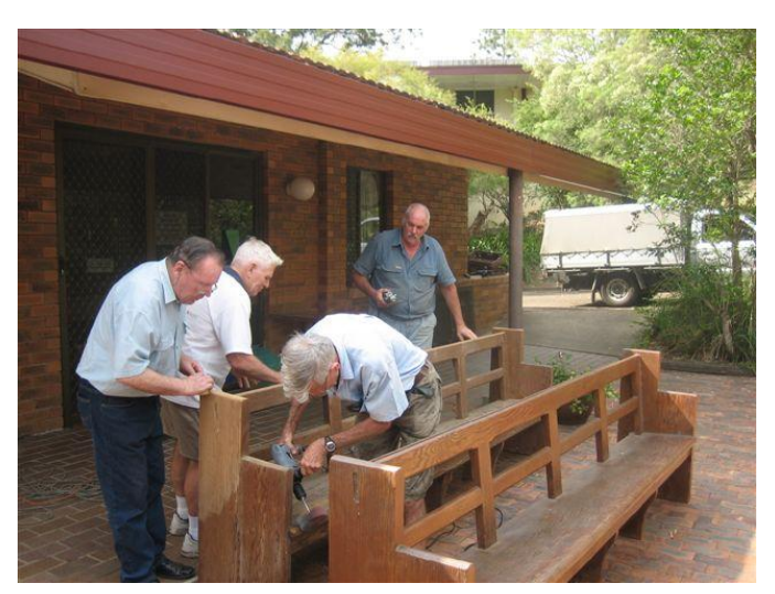
Above Shed West members busy cleaning down and sanding the church pews before the finishing coat was applied. Below is one of the restored pews.

A recent community and fund raising project was the restoration of two old and weathered church pews for the Kenmore Anglican Church. There are also a number of other community projects under development.