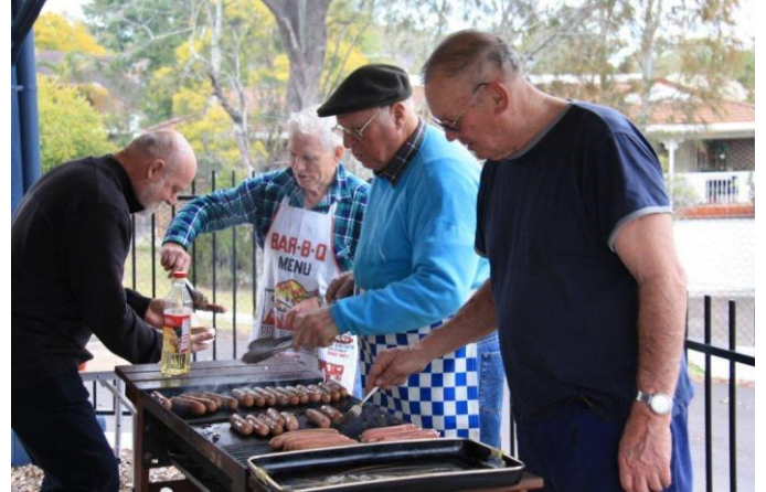
A sausage sizzle was organized for the day and enjoyed by all. There was even a practice run the week before.