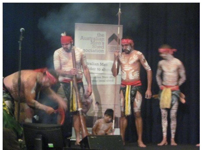
Delegates were treated to a welcome presentation by an indigenous group involving members of the Stradbroke Island Men's Shed.

Following the official welcome and refreshments delegates were invited to see the movie, Mad Bastards , about an aboriginal man sick of scraping out an existence in the city,