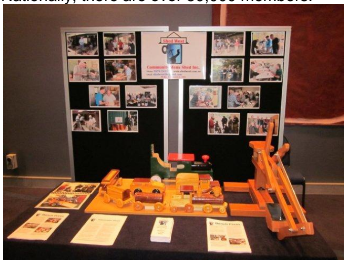
The Shed West display.

The movement is growing The Shed movement is growing quickly. There are over 600 sheds registered with AMSA. In Queensland there are 60 sheds whereas, twelve months ago there were fifteen sheds. Nationally, there are over 50,000 members.