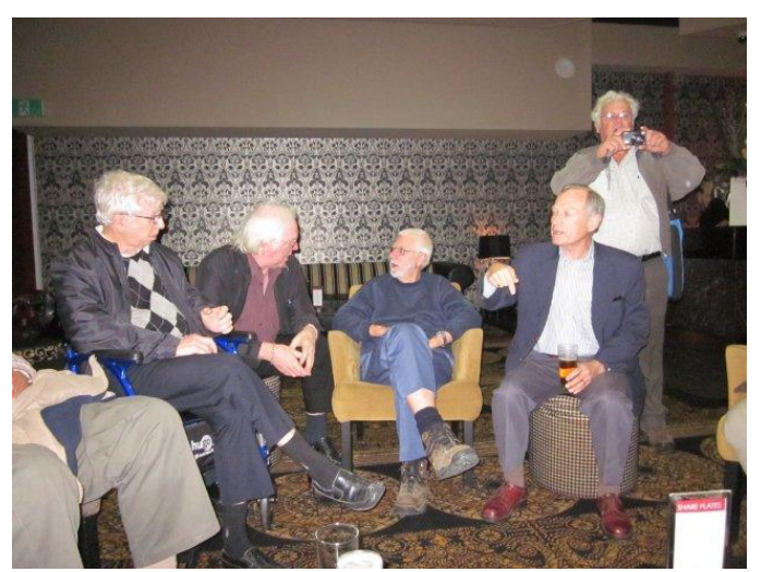
Shed West members enjoy a break at the Melbourne Hotel before the conference dinner at the Greek Club.

Visit the Shed at 98 Brookfield Road Kenmore Hills any morning Monday to Friday or enquire about the Tuesday afternoon meetings.