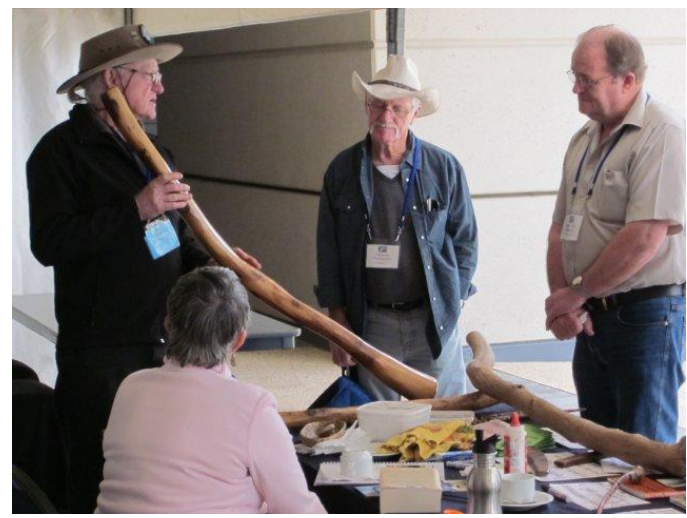
How to make a didgeridoo.

Feeling lonely, think you are alone try Men's Line 1300 78 99 78 or www.mensline.org.au