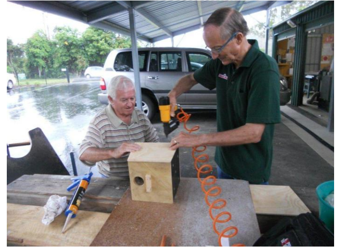
The building of possum boxes, in a range of sizes has been a popular community project.