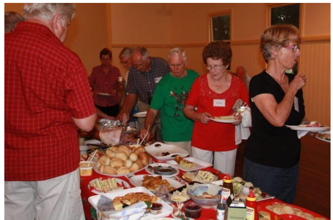
The feast at the Shed Christmas party was a night enjoyed by over seventy members, wives and partners.

These can be sent via email to <u>amsa@mensshed.net</u> or by post to AMSA, PO Box 68, Windale, NSW 2306.