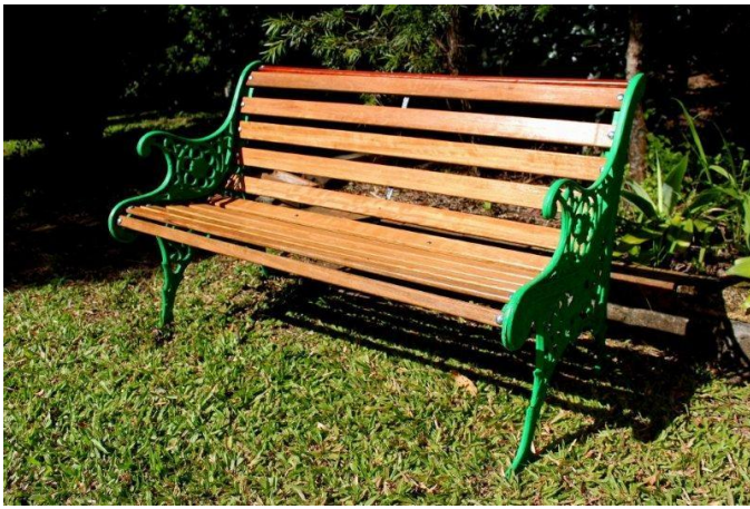
One of several garden seats restored in the workshop for the Brookfield Priory.