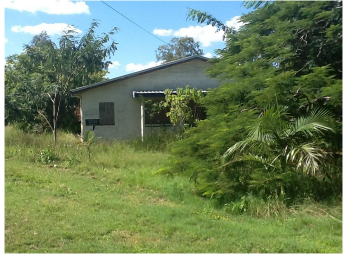
Above is the building which has been offered for the Bellbowrie Shed where members recently carried out a working bee. The end result is shown below.

information on which a business case for each can be developed and considered by the Committee and Shed membership.