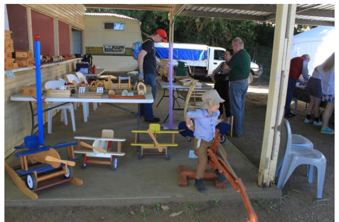
Shed West display at the Brookfield Show.

About.com has a great computing and technology page. Among other things it provides product reviews, easy to follow guides and useful safety tips. www.about.com