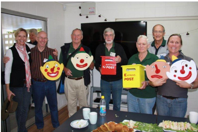
Presentation of training aids to McIntyre Centre Equestrian Foundation for Disabled Children.

If you're looking for a great online platform to store and share your photos, then flickr might just be the place. You can safely store your memories on this site and then easily share them on Facebook, email, Twitter and your blog. www.flickr.com