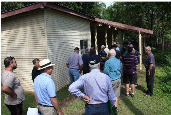
Shed members inspecting a potential shed site at Brookfield Showgrounds.

As President of Shed West, it is most pleasing to be stopped in the street or a shopping centre and complimented on the contribution that members of Shed West make to the community; you are to be congratulated. Our Shed continues to thrive with new members joining and the level of interest in sheds growing. Much can be attributed to the very interesting presentations and visits that have been arranged; also to the enthusiasm of a dedicated few members who manage the workshop and associated activities very well. Our recent display at the Brookfield show, whilst not overly successful as a fund raising venture, was most successful in showing the flag and raising our level of awareness in the community. Thanks to those who contributed in making it a success.