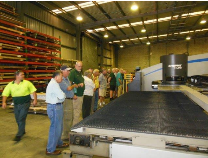
Shed members visiting DVR Industries where materials are laser cut.