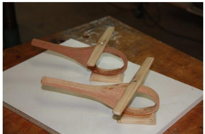
Part of Barry Borchart's helicopter fleet as part of the shed's toy making activities