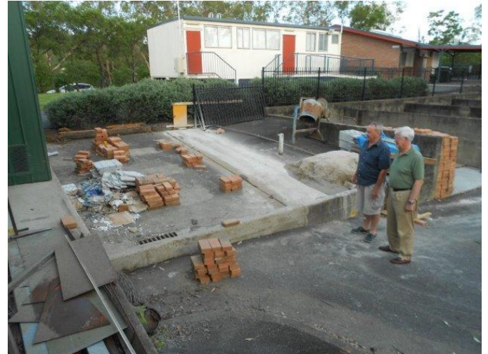
Doug Nissen (left) and Pat Gilles inspecting progress on the storage shed project.

Many of you will have seen that progress is well advanced on the new storage shed on the south side of our main Shed building. This facility will ease some of the pressure on space and safety in the main Shed by providing storage space for materials, including ready to use timber and equipment. Thanks to Pat Gilles for his input to this project, from obtaining BCC approval and funding support, to contractual arrangements, through to overseeing fit-out.