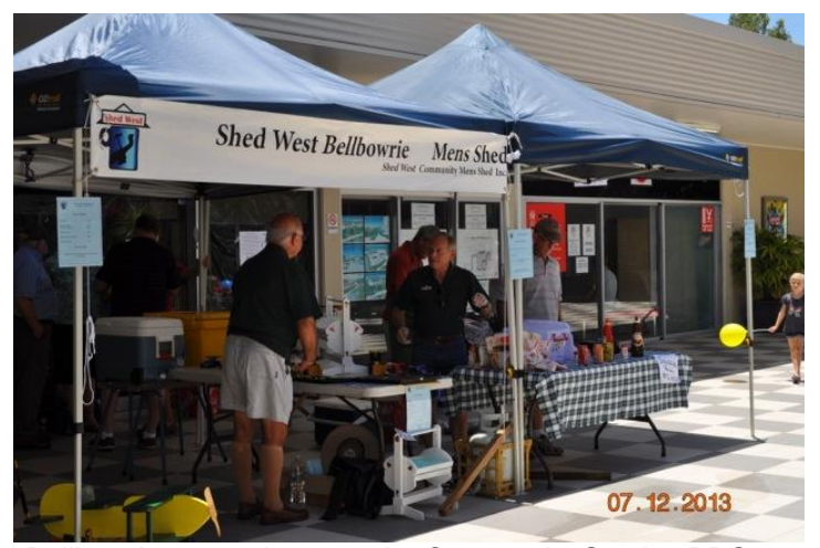
Bellbowrie group does regular Community Service BBQ at the Bellbowrie Sports and Recreation Club. These are good at raising Shed profile in the community as well as fund raisers.

National activity guidelines recommend adult Australians undertake at least 150 minutes of physical activity per week over five or more separate sessions.