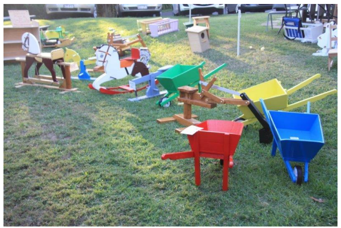
The toy display at the Anglican Church Christmas Fair.