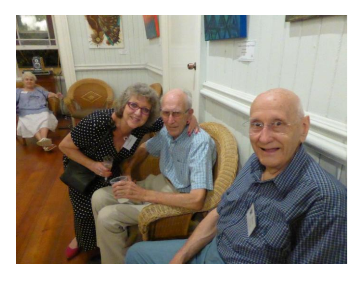
Above and below some scenes from the Shed Christmas Party.

Visit the Shed at 98 Brookfield Road Kenmore Hills any morning Monday to Friday or enquire about the Tuesday afternoon meetings at Kenmore or Wednesday afternoon events at the Bellbowrie Anglican Church Hall on Moggill Road at Bellbowrie.