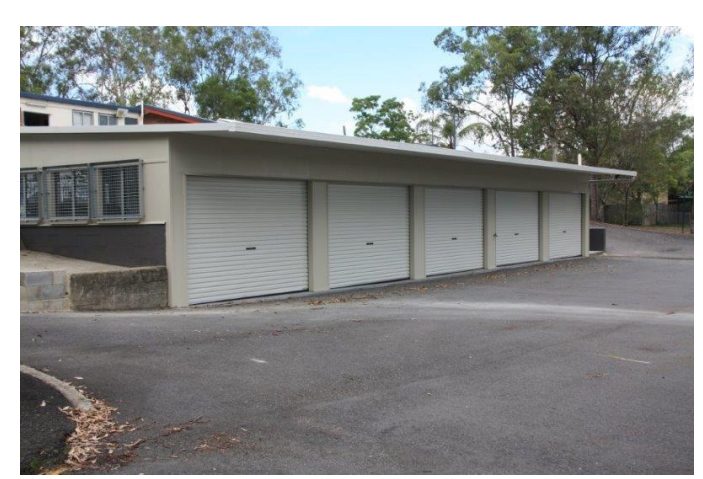
The new Brisbane City Council Community Centre Art Centre, which is located behind Shed West. The bay to the left will be available for metal work by Shed members.

In addition to plans for expansion of Shed practical activities, the Committee is aware of the value of more social activities, including those which can be shared with wives and partners. A program will be developed with members in the New Year, and any suggestions will be welcomed.