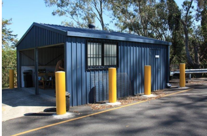
The Blue Shed is being fitted out for a range of activities many of which can be completed while seated and will specifically cater for our less mobile colleagues.