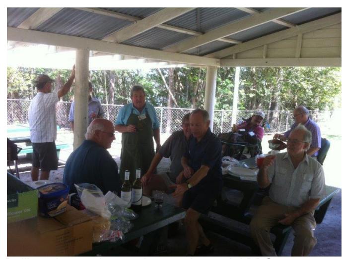
Bellbowrie members enjoy regular social BBQs

If you have high speed tools, don't quench in water: the effect may be too shocky for the steel and possibly produce small fractures at the cutting edge. The high speed steels easily handle temperatures of 700 to 1000 degrees F with no loss of hardness (bluing is around 580 degrees F). If the high speed tools are getting too hot to handle (during heavy grinding), I just place them on a large metal heat sink like a lathe bed and take a short break. The best rule for all steels, is learn to work without generating a lot of excessive heat."