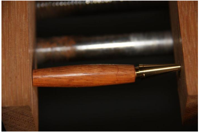
Similarly for the tip and then the mechanism which needs to be done last.