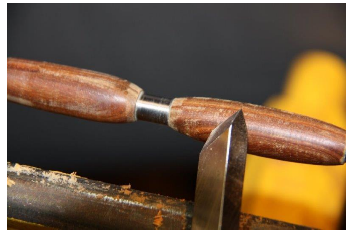
Advanced turners may prefer using a skew chisel as this reduces the amount of sanding required.