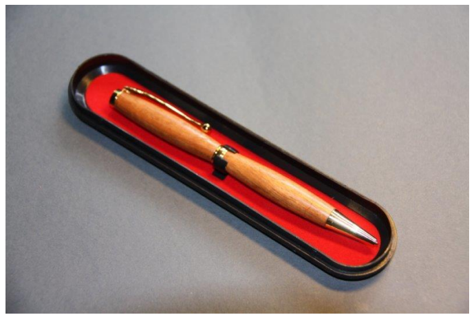
Now insert the refill put the middle ring on and press on by hand the cap section. All that remains to be done is insert in the packaging.