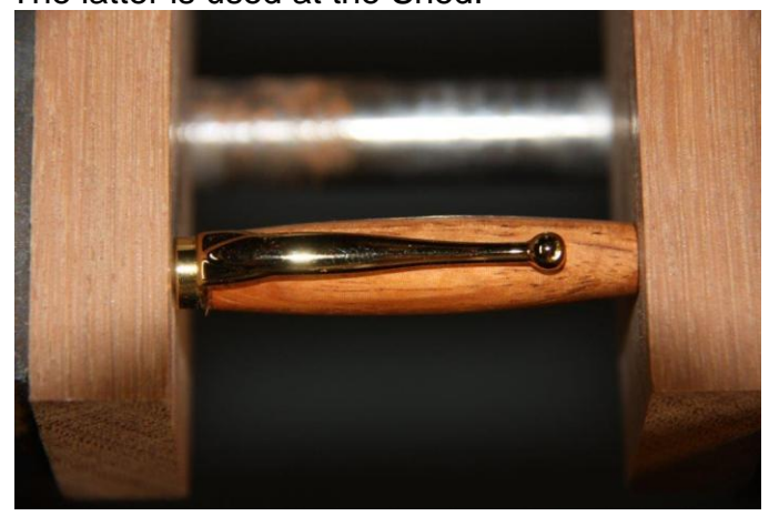
First assemble the cap components and press together in the vice.