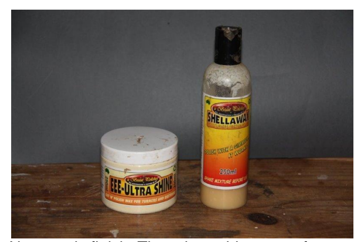
Next apply finish. There is a wide array of possible finishes but a good result is achieved with the products available at the Shed. First use EEE Ultra Shine followed by several coats of Shellawax.