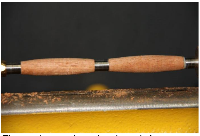
The pen is now shaped and ready for sanding.