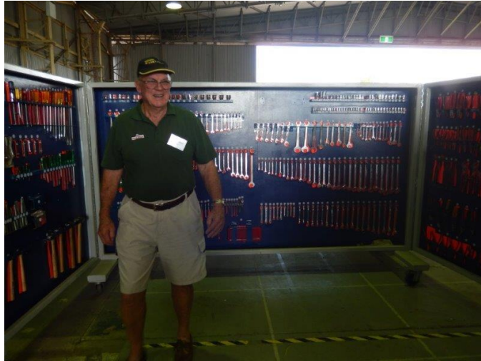
This is my tool kit.