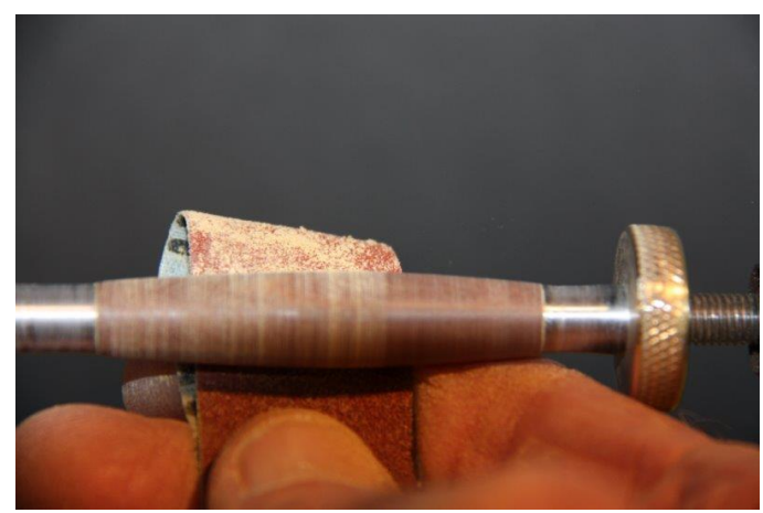
Sanding is carried out with 150, 240, 320 and 400 grit papers to produce a fine scratch free finish. Higher grades can be used for even finer finishes.