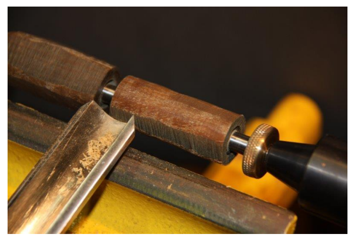
Use a gouge to shape the pen. This can be used for the whole project.

Continuing from last edition of Bench Press.