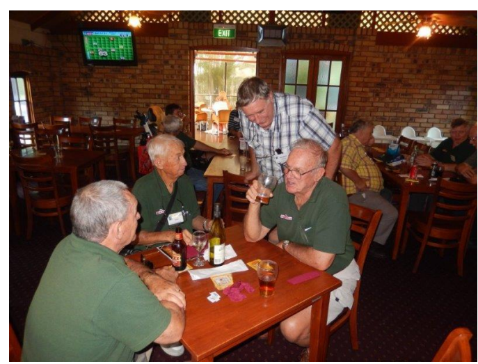
Members enjoying lunch at the Walloon Hotel.