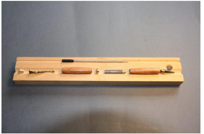
Now to assembly. Remove the turned pen barrel from the lathe and lay out with the pen kit components. There are several ways of assembling, including using the drill press, specially designed presses or the bench vice. The latter is used at the Shed.