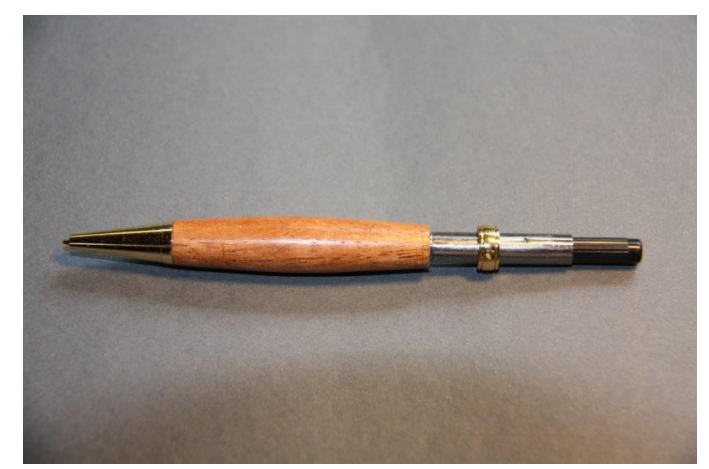
The result is shown above. Press the mechanism in to just show the ring around the mechanism. Then test with a refill.