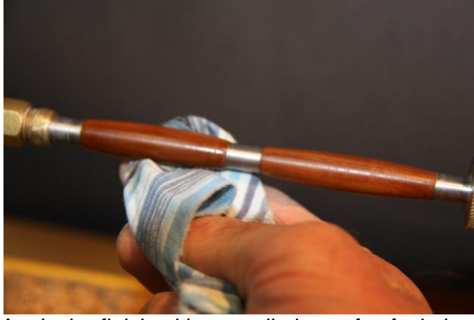
Apply the finish with a small piece of soft cloth and buff with a clean piece of cloth.