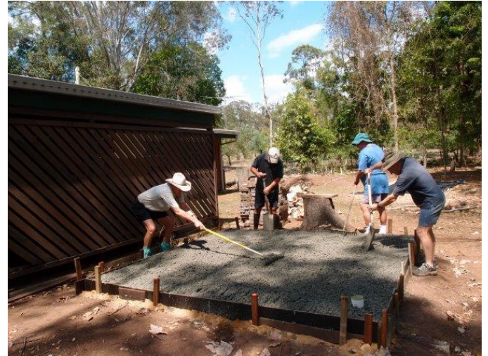
Bellbowrie members hard at work on new facilities at the Shed.

environment. Meetings are still held each Wednesday afternoon at 1pm, usually with a topical presentation from a guest speaker. Visits and luncheons are also conducted on some Wednesdays. A drop in centre is operating on Tuesday mornings from 9am and the Cottage is currently offering activities including computing, gardening, tool sharpening and social games. Since moving to the Cottage, attendance at Wednesday meetings has grown from around 20 to well over 30 each week.