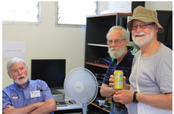
Members and visitors at the computer club display on open day.

Both campuses are having a break over the Christmas New Year period. The Shed West workshop will re-open on Monday 12 January and the regular Tuesday afternoon programs will recommence on Tuesday 27 January. Shed members may use the workshop provided there are a minimum two members present and need to arrange a key through the regular key holders. Bellbowrie is having the