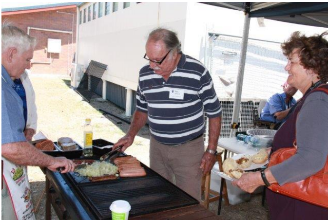
BBQ duties on open day at the Kenmore campus.