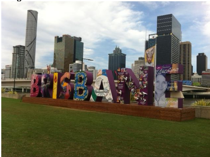
The BRISBANE sign at Southbank for the G20.

In June, through QMSA, Shed West was invited to join 7 other Sheds in the construction of a very special "BRISBANE" sign as a signature component of the welcome to participants in the G20 Conference. In addition to agreeing to manufacture the very large letter "S" in the sign, several of our members took a leading part in the overall structural engineering design, development of the detailed manufacturing data, and co-ordination of the inputs from the 8 Sheds involved. I'm sure that for those who have seen the finished product, and all who are familiar with the public appreciation of the sign at Southbank, will join me in congratulating the Shed West project team on the success of their efforts, and thanking them all for a major contribution to the image of Men's Sheds.