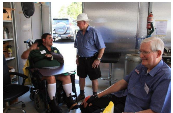
Members enjoying the facilities in the Blue Shed.