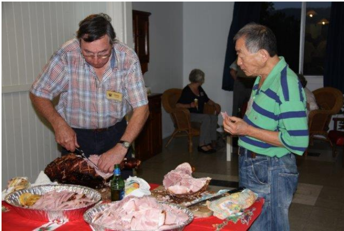
Our expert carvers at work carving the ham at the Christmas party.