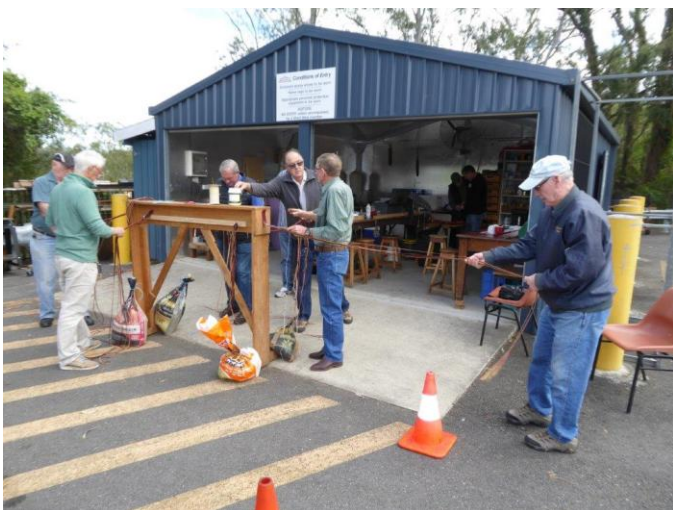
Participants hard at work in the very successful whip making course at Kenmore Shed.

Whilst I am not familiar with how Bellbowrie operates, no one has reported anything negative concerning this campus. In fact, Bellbowrie punches well above its weight. Well done.