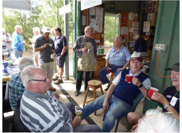
Smoko is the time to catch up with others when the machines are quiet.

during the past year. I must thank all members of these committees and the general membership for their help and cooperation in ensuring the smooth running of Shed West's activities. I wish the incoming Committees for 2016-17 all the best.