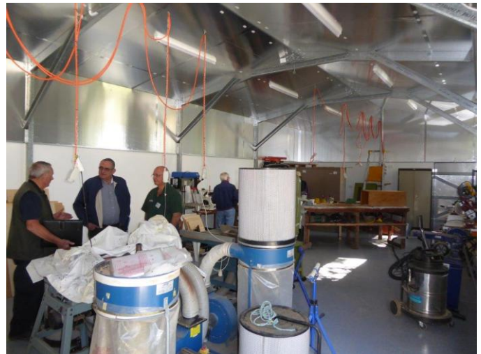
Fitting out the terrific new Shed at Bellbowrie.