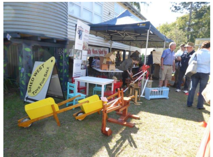
Kenmore campus toys for sale at the Upper Brookfield School.

equipment, and some funds available to expand on existing and new interests. There is enormous talent and experience in our membership, coupled with maturity, energy and willingness. We have commitment, and we care for each other. What other ingredients could we possibly need to make Shed West a wonderful organisation to be a part of?