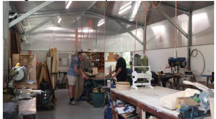
Inside – note floors and insulation.

Raising funds was a major activity leading up to the end of last year. The Shed had stalls selling toys, woodwork, leatherwork and raffle tickets at the fortnightly Brookfield Markets, the Mitchelton Night Market and a Handmade Goods Market at the Moggill State School. Conducting Bunnings sausage sizzles is a good source of revenue when we are fortunate enough to be offered a place.