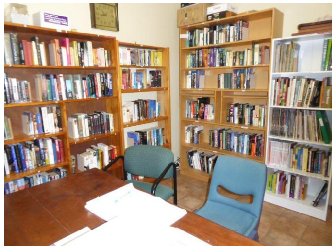
Bellbowrie Shed Library.