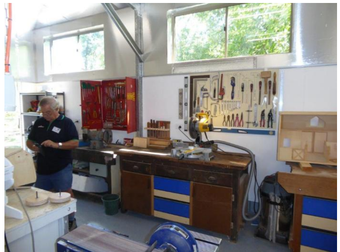
New Workshop at Bellbowrie.

Leather work is proving to be very popular with members and has been the source of quite a lot of revenue for the Shed. Articles being crafted include: belts, handbags, purses, horse bridles, harnesses, whips, stubby holders, etc.