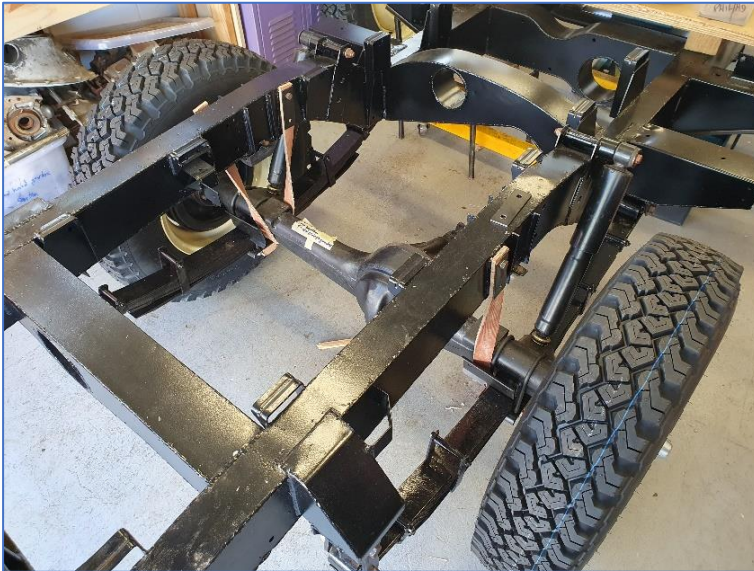
Refurbished rear springs, axle and road wheels

With Ollie's chassis back in the workshop, refitting various refurbished parts has commenced. The front and rear suspension and axles are now attached to the chassis, and work is underway installing the front hubs and steering arms. New road wheels and tyres are being progressively fitted.