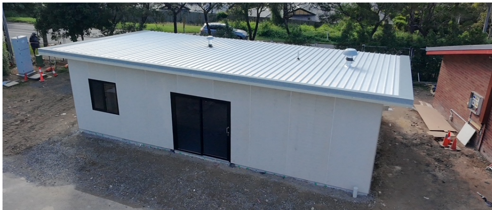
Progress on the donga replacement building