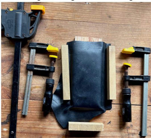
Alan's mobile phone case underway