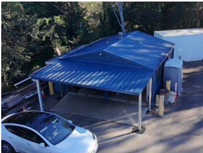
Blue shed awning installation

Recent (4 June) aerial photos from Shed West's drone pilot Stu Reed: