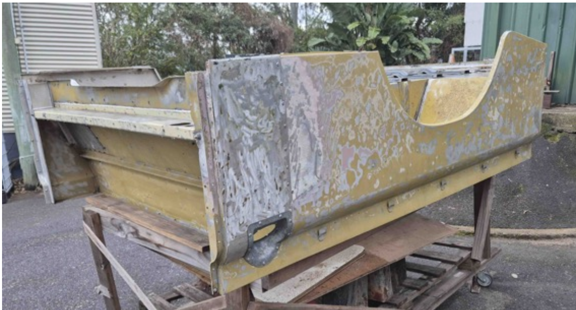
The tub under repair – soon to be painted marine blue

Damaged parts have been removed and replaced with matching items from the spare tub. The tub and roof should go off site for painting by the end of this month.