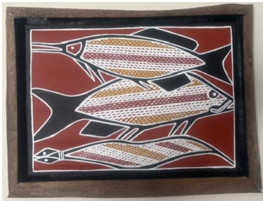
Stu's Floating picture frame made of recycled tree trunk