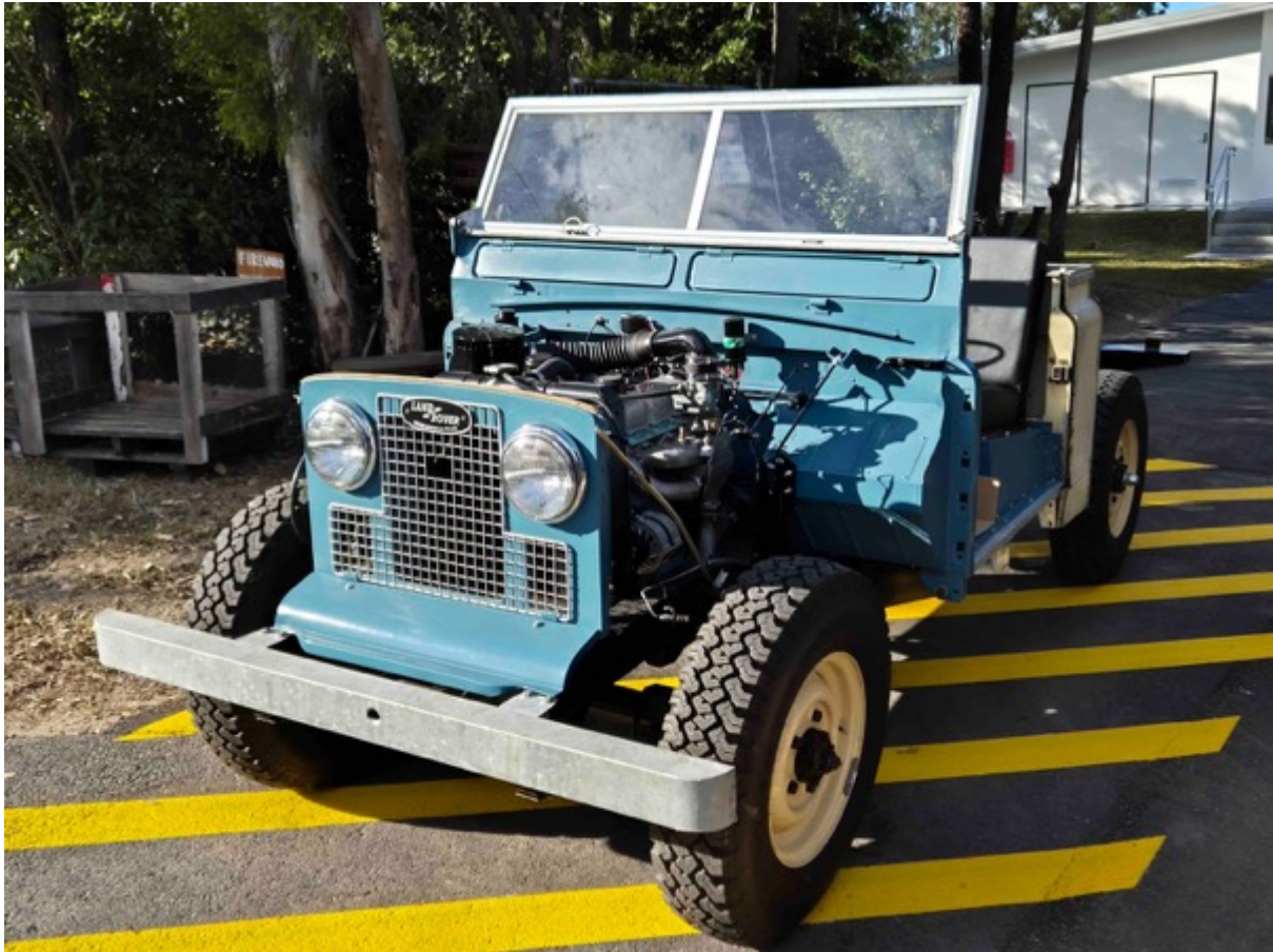
Ollie – July 2025

As with all 60+ year old vehicles, there are still some minor mechanical and electrical issues requiring attention.