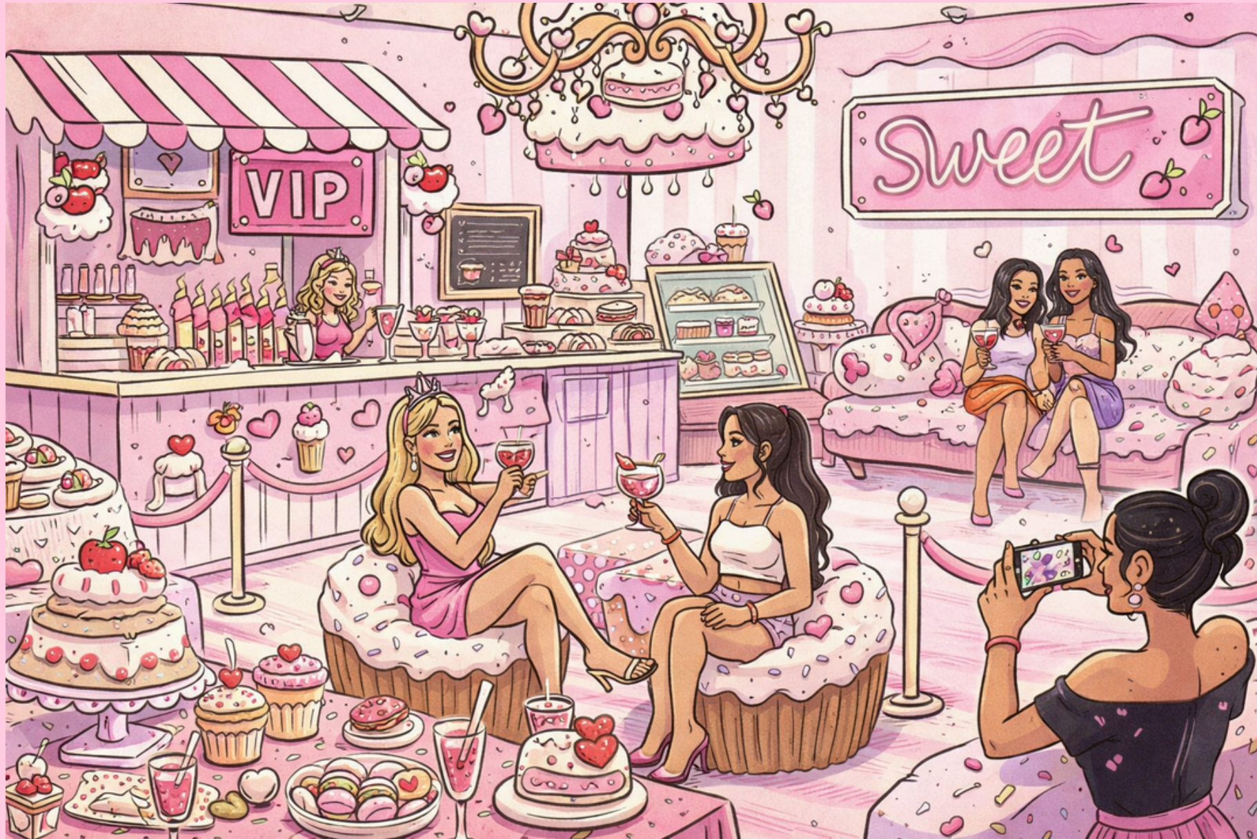
DESSERT THEMED VIP LOUNGE