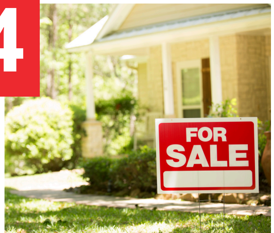
Positive Impacts on Surrounding Properties