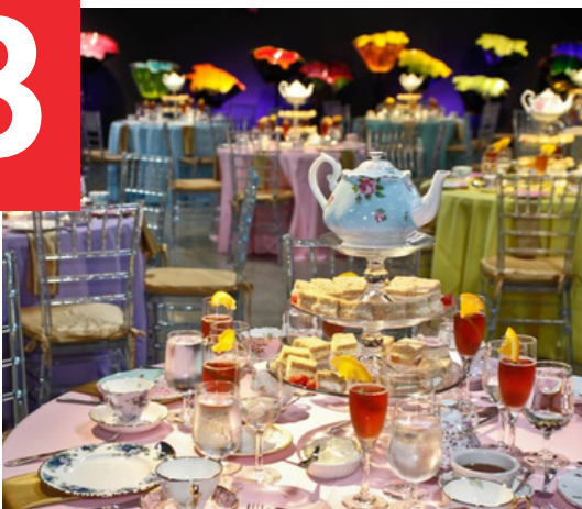
Incremental Ad Valorem Tax Revenue