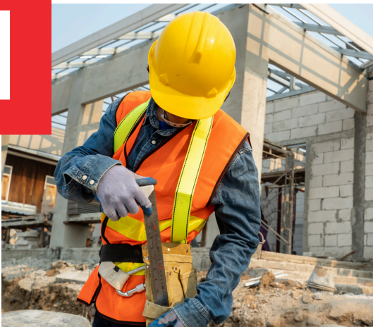
Short-term construction employment and expenditure