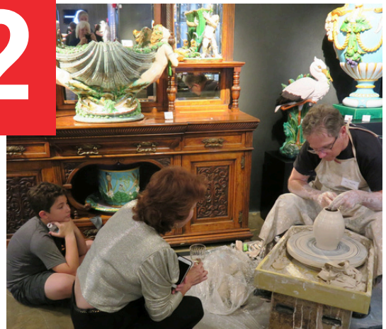
Long-term residential and museum employment and visitor expenditure