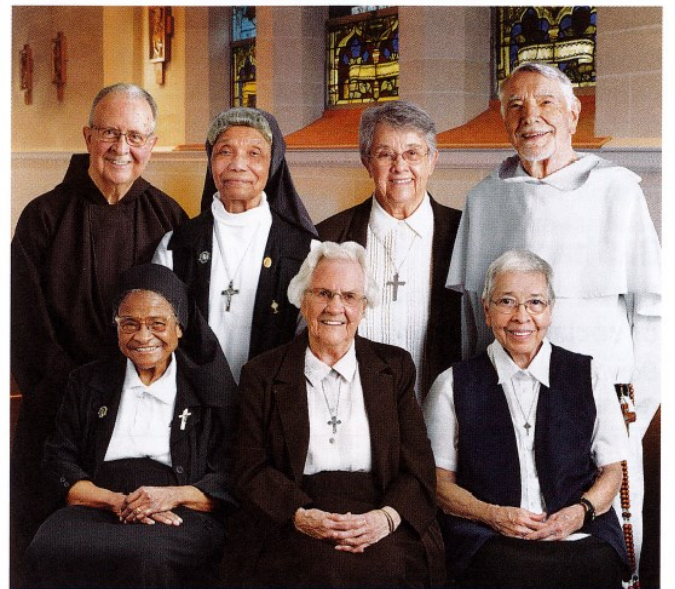
Please give to those who have given a lifetime.