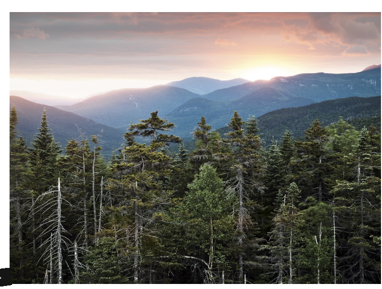
July 18-21 White Mountains, New Hampshire