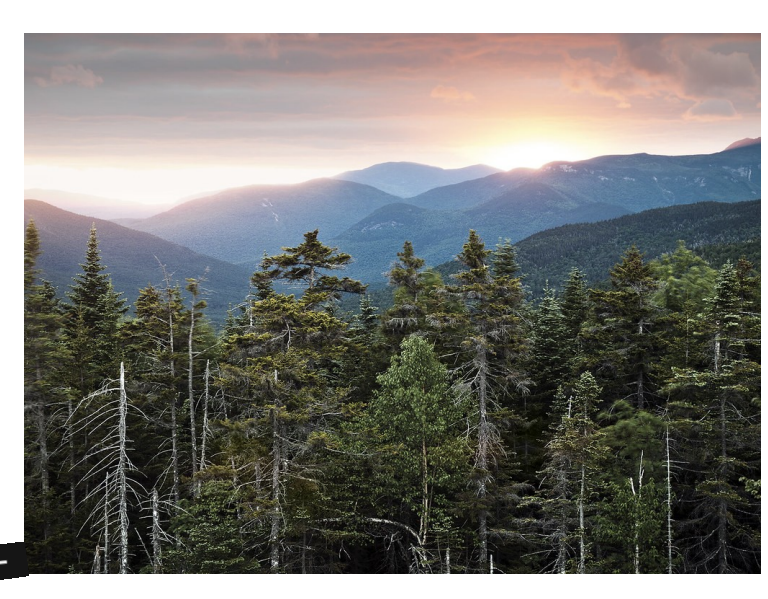
July 18-21 White Mountains, New Hampshire