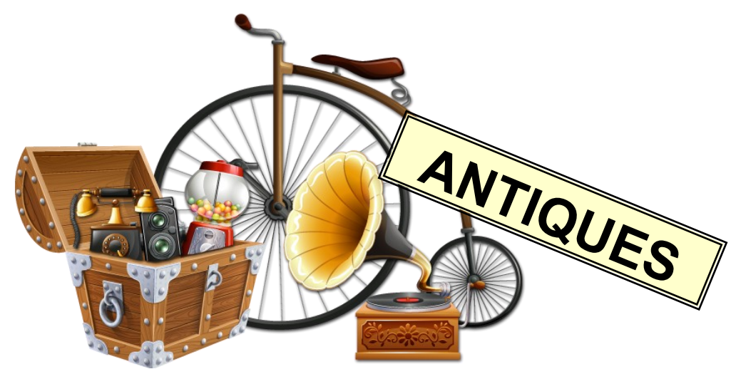
September 16-17 Brimfield, Massachusetts – Antique Fair