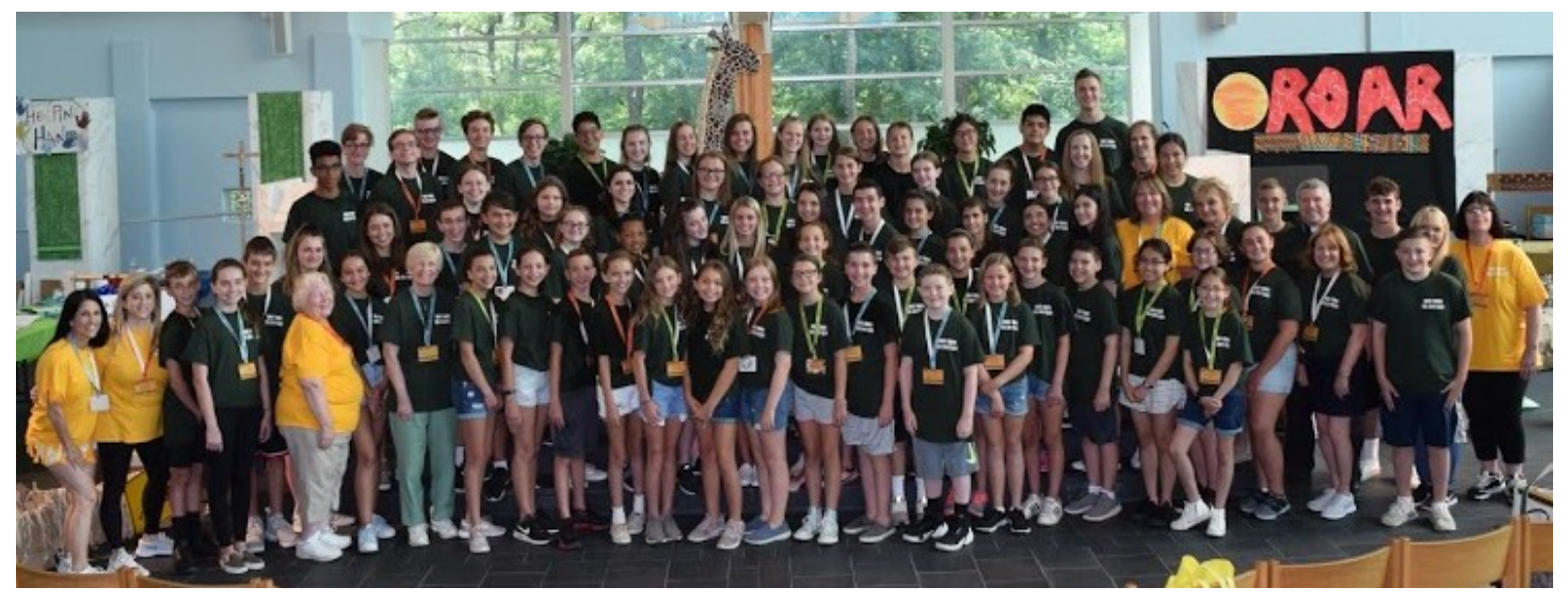
VBS was a huge success! We couldn't have done it without everyone's help!

Thank you to all parishioners for your generous donations. And, thank you to Little Vincent's for the pizzas for our volunteers. Also, we'd like to mention the generous donation by our campers. We will be sending a check for $800 to Catholic Relief Services, which is considerably more than last year! We appreciate your generosity! Our VBS campers, also, made cards and sent them to Operation Gratitude and Support Our Troops. These two organizations send cards to deployed troops overseas. We are very proud of our campers' work!