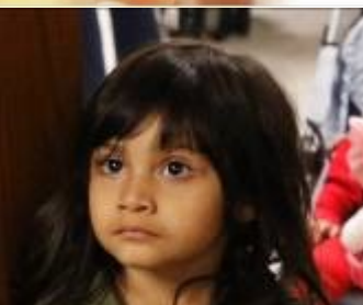
CARING FOR GOD's PEOPLE

Your gift could help support youth, young adult and campus ministry programs.