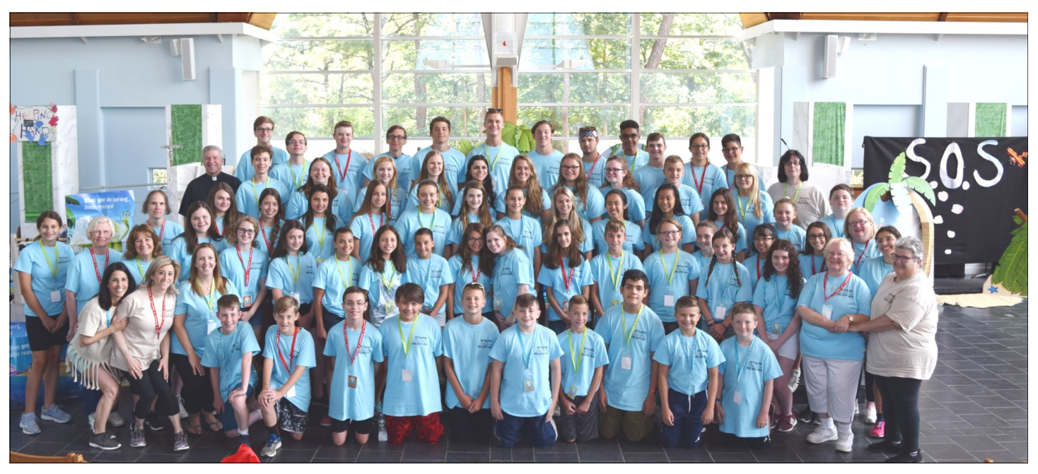
VBS was a huge success! We couldn't have done it without everyone's help!

Thank you to all parishioners for your generous donations. Thank you to Little Vincent's for the pizzas for our volunteers. And, thank you to the Knights of Columbus for supplying bottles of water for our campers and volunteers for the entire week! We'd like to mention the generous donation by our campers to Group Cares, Operation Kid-to-Kid of $593.34. Also, our VBS campers made cards and sent them to U.S. soldiers in the Wounded