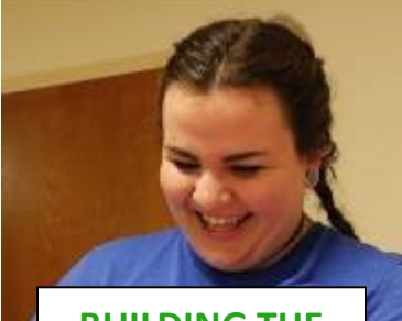
BUILDING THE KINGDOM OF GOD

Your gift could help support a Seminarian's or Deacon's education.