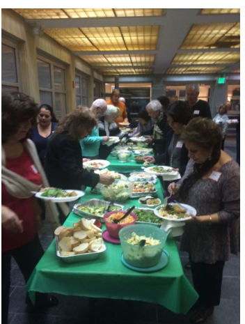
of peace. We continue to pray for peace and for our nation.

The consensus was it was a simple, yet beautiful evening that provided a sense