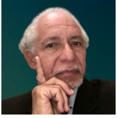
Ambassador Curtis A. Ward