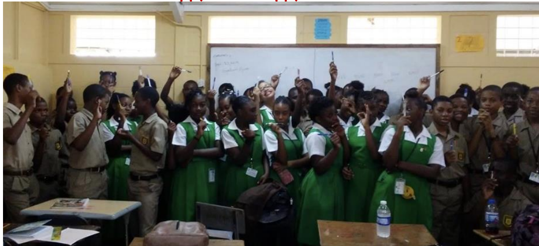
First Formers in a happy mood at the start of the term after they received complimentary pens facilitated by the 21-BOX PROJECT. We need more. Just collect and send to the Project Co-ordinator.