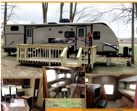
Camper Rental #145 Sleeps 8