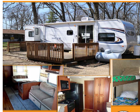
Rental Trailer #149 Sleeps 8-10