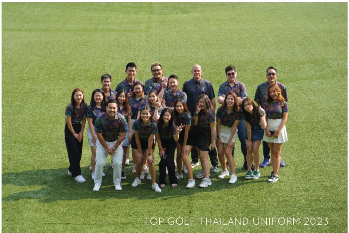
TOP GOLF THAILAND UNIFORM 2023