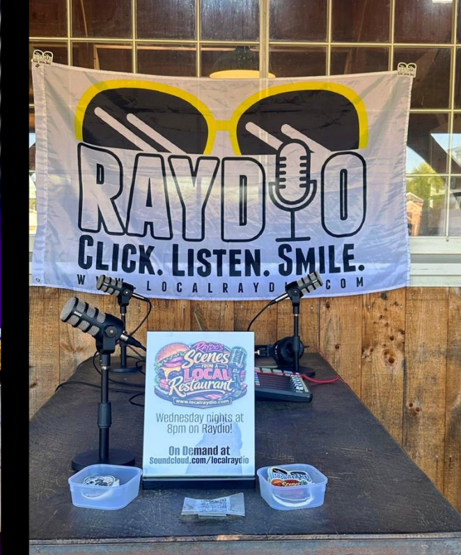
Raydio's Scenes From A Local Restaurant at Taste of Tri-County