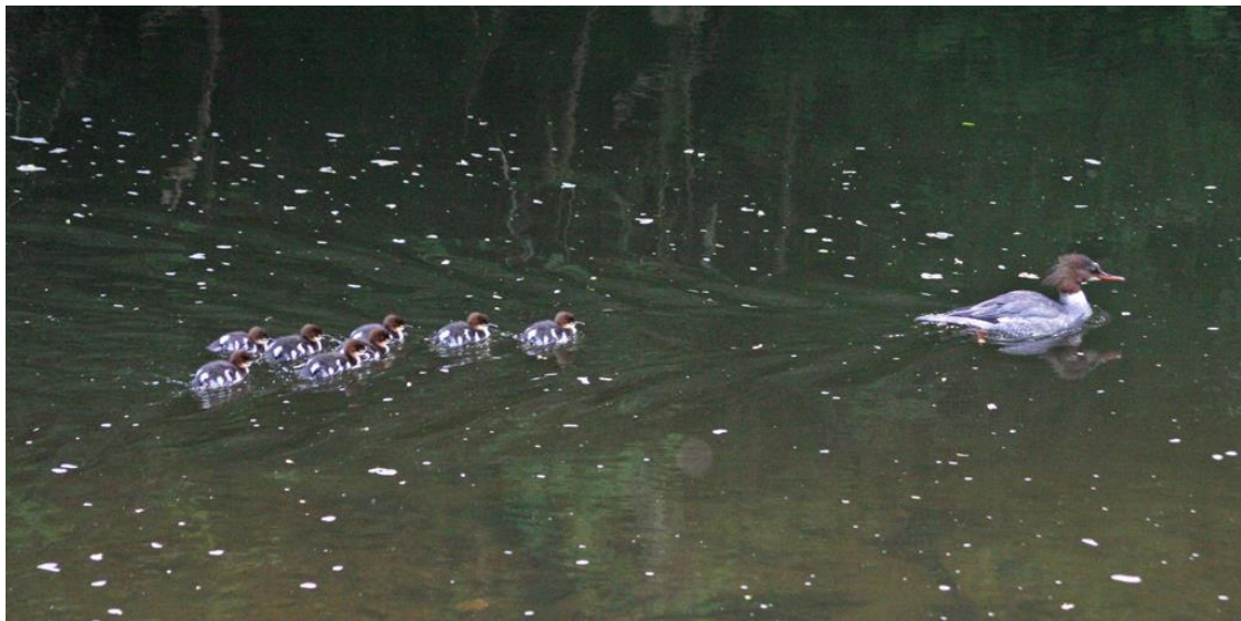
Female Goosander with chicks

Don't forget to let us know if you see a red kite via the " Contact us " page on our website