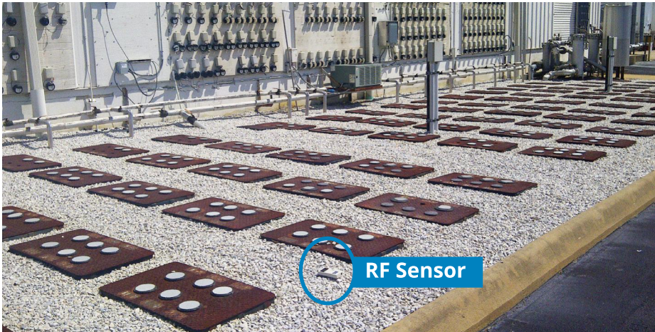
Results of Test at Neptune’s Engineering Facility (microwatts per square centimeter, or \mu\text{W}/\text{cm}^2 ) 6

There will always be people who, for whatever reason, prefer not to have a “smart meter” installed at their residence. For this small group, the