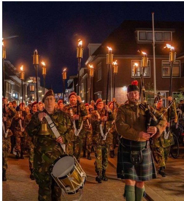
Torchlit procession in Katwijk

As with many of the Allies, their merchant fleet was advised not to return to home ports for fear of capture and either re-use or destruction of the vessels by the Germans. On June 6 th , 1940, Queen Wilhelmina issued a decree imposing a compulsory service for sea going personnel for the duration of the war. From fishing vessels working out of British ports, to coasters evacuating troops from Dunkirk, passenger ships as troop carriers, tugboats towing artificial harbours on D-Day along with the cargo ships and tankers in the many convoys. This compulsory service ended on March 2 nd , 1946. Men could once again return home to