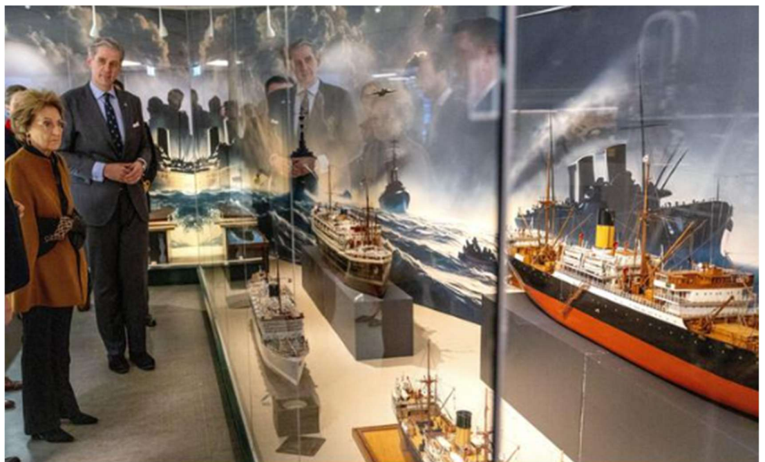
Princess Margriet at the Katwijk Museum viewing some of the ship models.