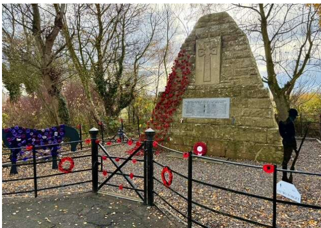
This year, Swinton commemorated women in wartime