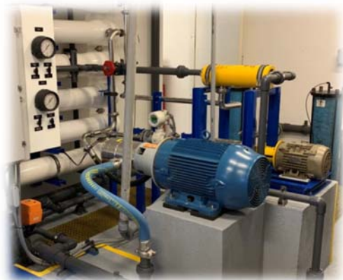
Axial Piston High Pressure Pump and Companion Isobaric Energy Recovery System