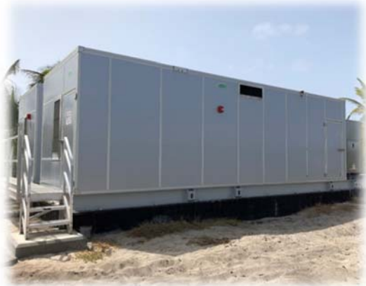
Switch-gear module (foreground) and battery module