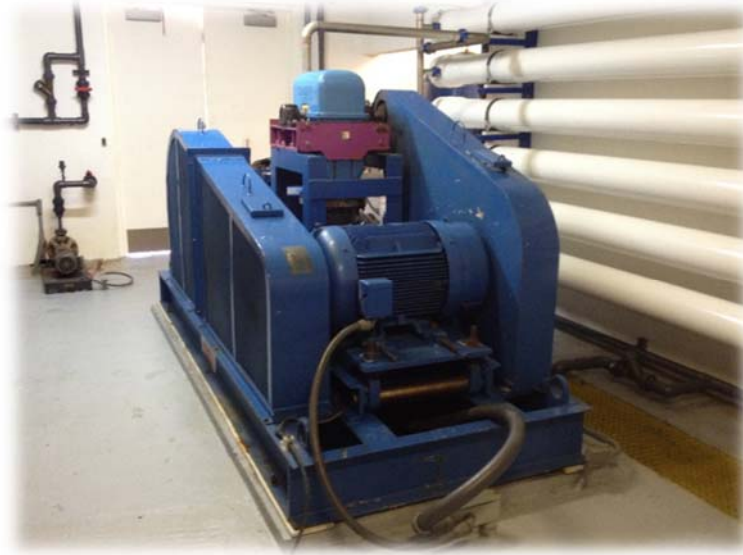
Original Membrane Feed Pump, Calder Turbine and Drive Motor