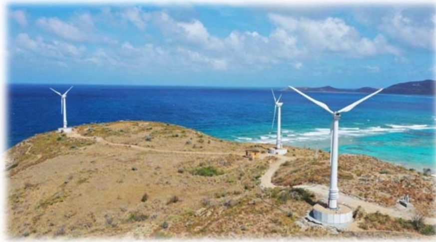
100 KW Wind Turbines