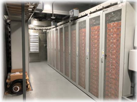
Internal view of battery module