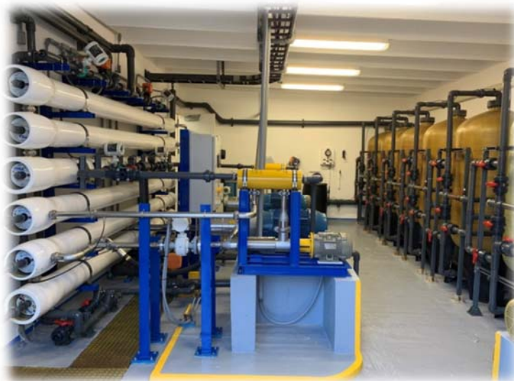
Revised Building Design

The upgrades to the desalination plant were completed in November 2018 (see following photos). The estimated unit power consumption for the revised design was 11.8 kWh per 1,000 gallons of permeate produced. At the time of commissioning, the reconfigured plant had a unit power consumption of 10.3 kWh per 1,000 gallons of permeate produced or 12.7 percent below the design value and 29 percent below the old plant value.