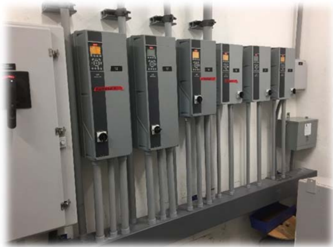
Wall Mounted Three-Phase Power System