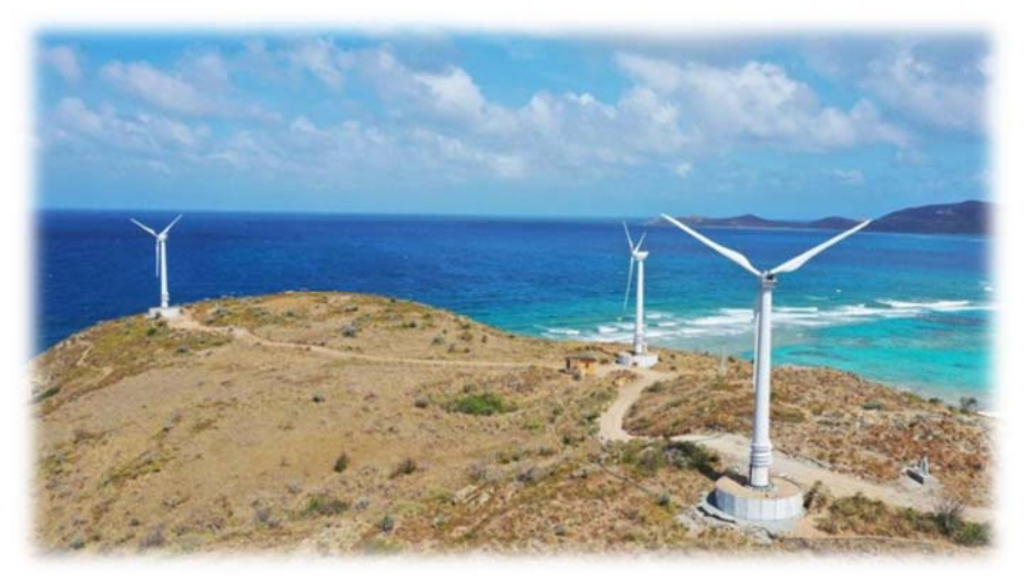
100 KW Wind Turbines