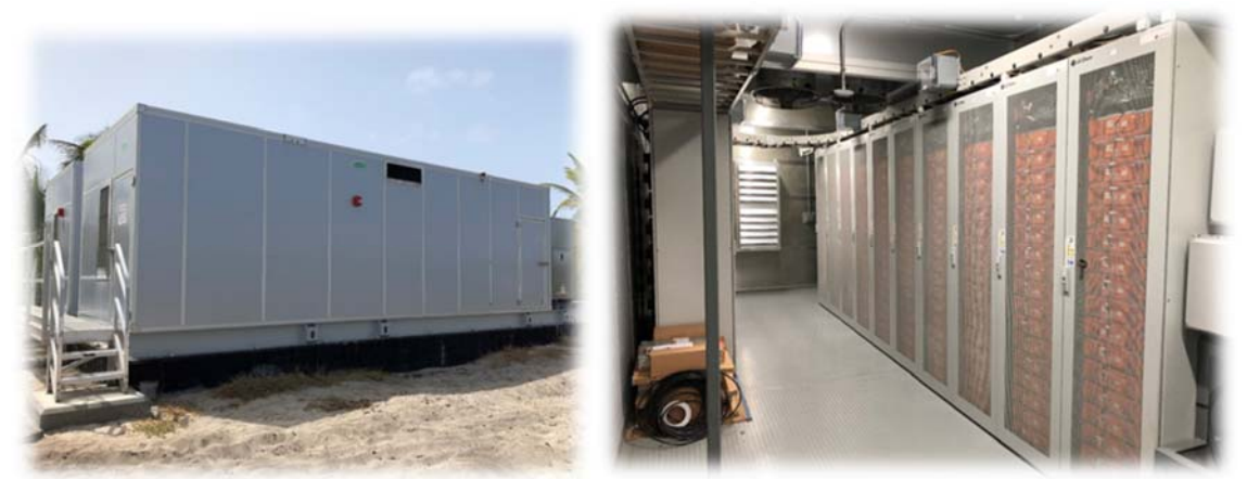
Switch-gear module (foreground) and battery module