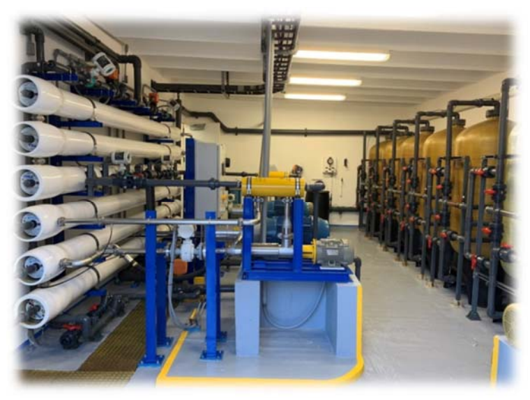
Revised Building Design

The upgrades to the desalination plant were completed in November 2018 (see following photos). The estimated unit power consumption for the revised design was 11.8 kWH per 1,000 gallons of permeate produced. At the time of commissioning, the reconfigured plant had a unit power consumption of 10.3 kWH per 1,000 gallons of permeate produced or 12.7 percent below the design value and 29 percent below the old plant value.