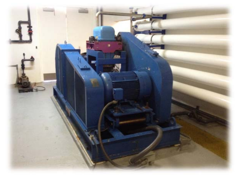
Original Membrane Feed Pump, Calder Turbine and Drive Motor