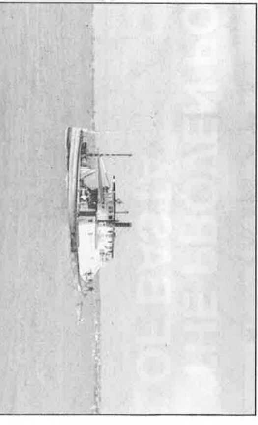
The 1908 built Oscar W on the water.

Coorong District Councilors have agreed to contribute $2,500 towards the production of a retail video of the mail run re-enactment across the lakes. Council will receive intellectual property rights in the production for use of the video in marketing and tourism activities. Councilors are considering the allocation of funds in future tourism budgets for similar, high quality digital material with the aim of generating a resource library of marketing material for promotional use.