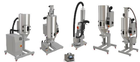
Material Drying and Conditioning. The only dryer with VFDs for Process and Regeneration circuits. No one is better.