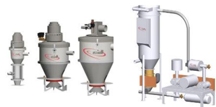
Material Loaders, bulk handling systems, silos, day and portable bins.