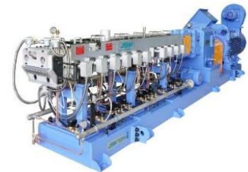
Twin Screw Extruders for compounding fillers, masterbatch, polymer alloys, GF/CF, biomass, long fiber kneading, and Chemical and mechanical recycling

JSW Twin Screw Extruders are machines used to add value to plastic raw materials. The TEX-α R and TEX III series machines are capable of continuously mixing, devolatilizing, and dehydrating multiple plastic materials and additives to achieve efficient production of high-performance plastic materials that meet market needs. We also have experience in plastics recycling applications.