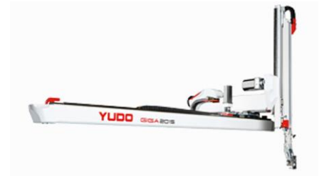
Top and Side Entry robots and Sprue Pickers and Factory Automation

Abiman Engineering is the best-in-class engineering solution providers based on its state-of-art Multi-tasking Robots in plastic injection molding industry. We are striving to meet customer expectations by holistic and seamless understanding and knowhow of plastic injection molding process. We provide the most optimum engineering solution covering all processes from first to last by value chain and process analysis.