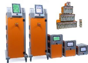
Hot Runner Temperature Controllers. 1 to 336 zones

S.i.S.e Temperature Controllers use high-performance Permanent Self Tuning software designed and developed by SISE, which continuously recalculates the best settings for each zone, instantly responding to any changes in process parameters. With its line of Hot Runner Temperature Controllers offering from 1 to 336 zones, SISE provides solutions suited to any mold size.