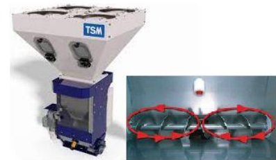
Gravimetric Blending ( patented mixing chamber ) with four to six components and up to 11,000 lbs/hr

For over 40 years, TSM supplying blending and control systems that enable companies to achieve the level of precision that their production processes demand, operating within a spirit of trust, compliance and fairness that has become our hallmark. Our blueprint for success is based on three core planks: Innovation, People and Experience – each of them feeding into a single vision of TSM being the world-leader in gravimetric blending, controls and material management.