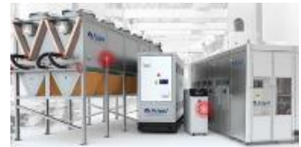
World Leader in Non-Evaporative Fluid Coolers, portable Chillers/TCU, Air- and Water-Cooled Chillers