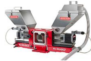
In Line Dosing and Blending of additives and regrind directly into pellet stream.

The Movacolor dosing technique is based on the in-line dosing of masterbatch, powder, regrind or liquid colorants into virgin material. Movacolor systems meet the need for high volume, quality and reliability in the dosing of masterbatch, powder, regrind and liquids for producers of PET preforms toys, household goods, automotive components, packaging, medical devices, profiles, pipes, cables, sheets, film and many other products.