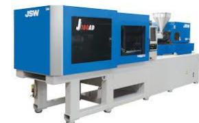
All Electric High Performance Injection molding machines.

Leading the growth and advancement of technology and innovation in plastics machinery for over 50 years, JSW provides a full line of all-electric injection molding machines , ranging from 30-3000 metric tonnes and offers ease of operation, safety, and environment-friendly improvements such as energy, and space-saving features.