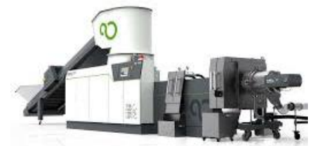
Versatile Recycling Plant for Industrial Scrap

Thanks to the intelligent combination of the double feed ram system and single-shaft shredder the PureLoop plastic recycling machine is able to process a very broad spectrum of different material types and forms: from heavy, free-flowing and self-feeding plastics to lightweight and large-volume materials. The high-performance ISEC evo also makes light work of processing extremely tear-resistant input material such as fibers and strapping.