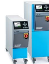
High Temper Water TCUs. Up to 446F Water Only.