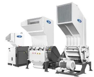
Size Reduction Machines and material conveyance.

Tria has specialized in the design and manufacturing of rotary knife granulators and grinding systems for over 57 years. Our main objective is the design and manufacturing of granulators, systems and solutions which meet the high efficiency and safety requirements that are industry specific. We strive for excellence in providing outstanding products and stand by our superior craftsmanship and dedication to quality.